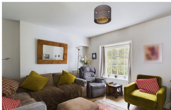
Property details: Portland Road | Worthing | BN11 1QA