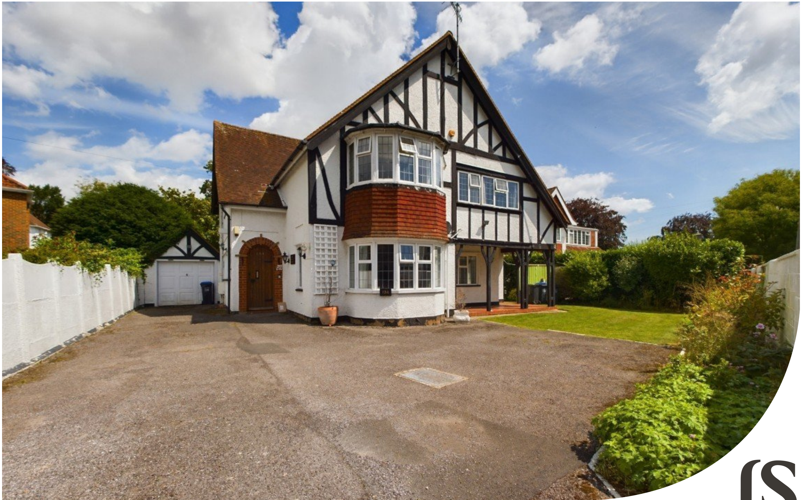
Offington Drive | Worthing | BN14 8PT £725,000