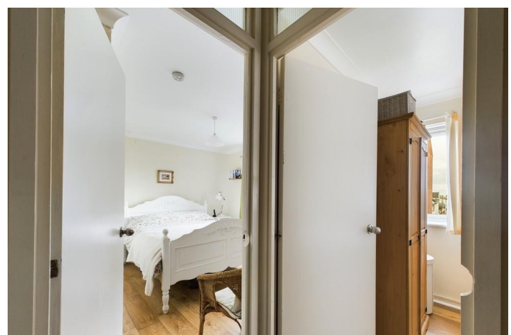
Property details: Dyke Road | Brighton | East Sussex | BN1 5AW