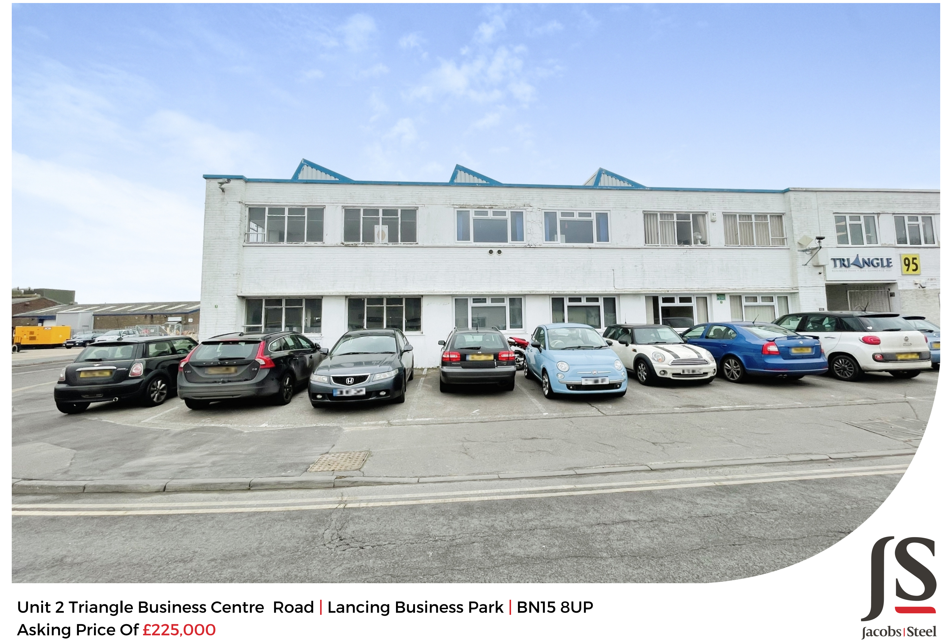
Asking Price Of £225,000