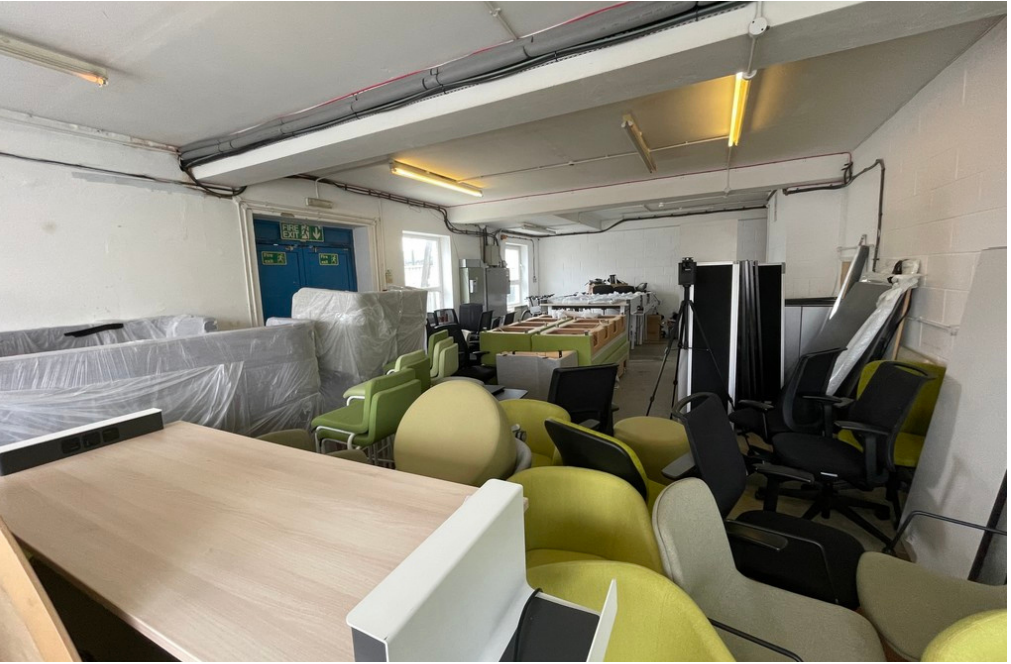
Property details: Triangle Business Centre | Lancing Business Park