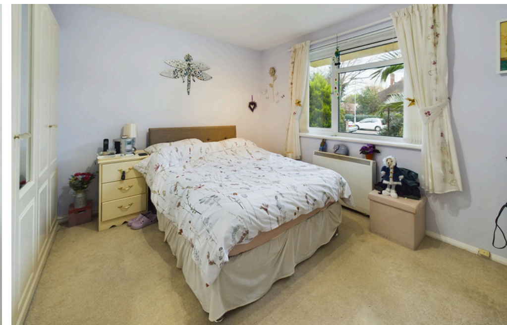
Property details: Charlwood Lodge | Lansdowne Road | Worthing | West Sussex | BN11 4NF