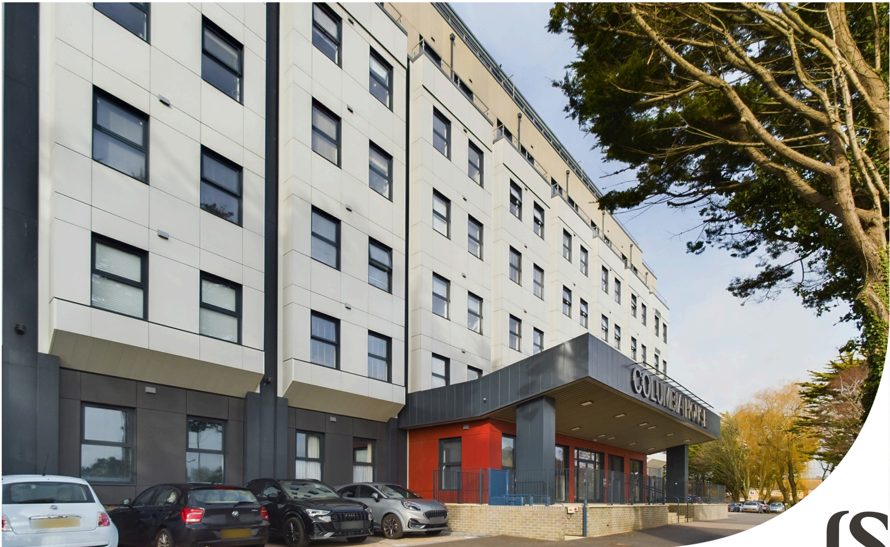
Columbia House | Worthing | West Sussex | BN13 3YR Guide Price Of £200,000