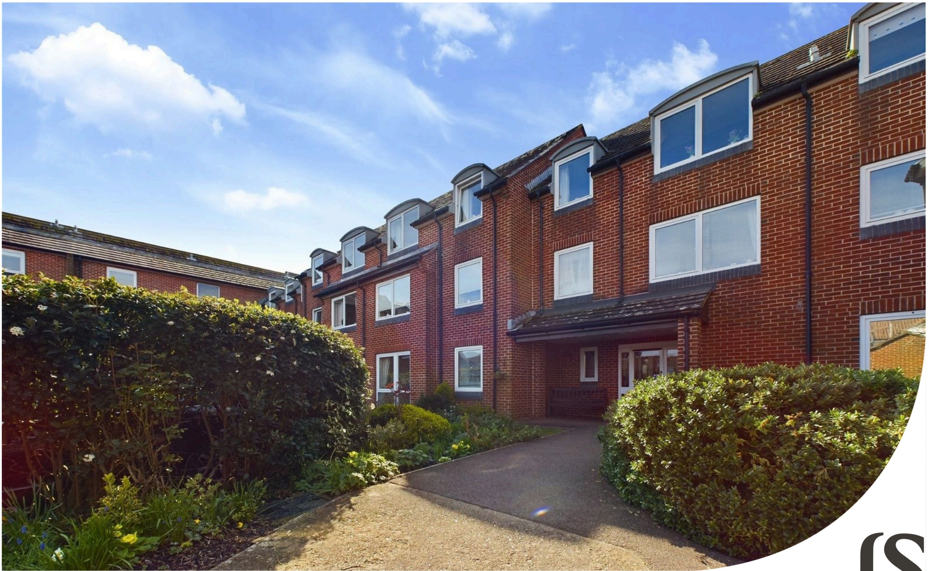
Flat 51, Homesearle House, Goring Road, Goring-by-Sea, Worthing, BN12 4PW Guide Price £80,000