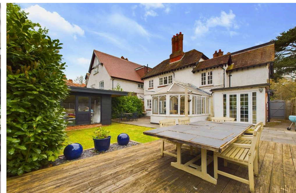
Property details: Offington Lane | Worthing