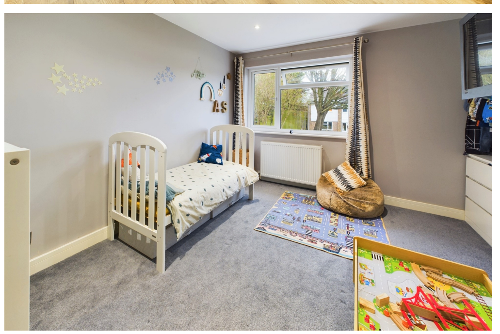
Property details: Cissbury Way | Shoreham by Sea | BN43 5FW