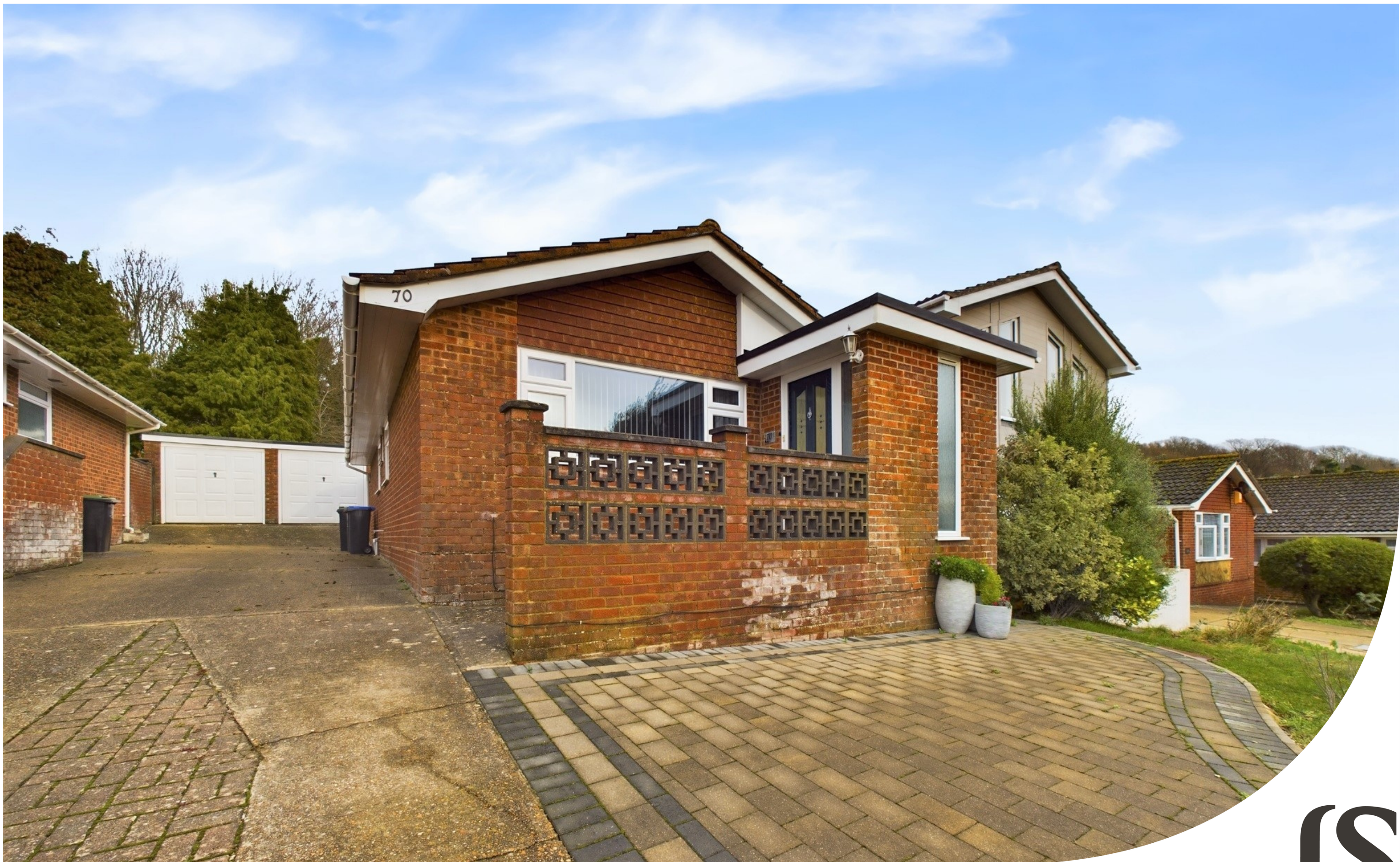
Slonk Hill Road | Shoreham by Sea | BN43 6HY Guide Price £500,000