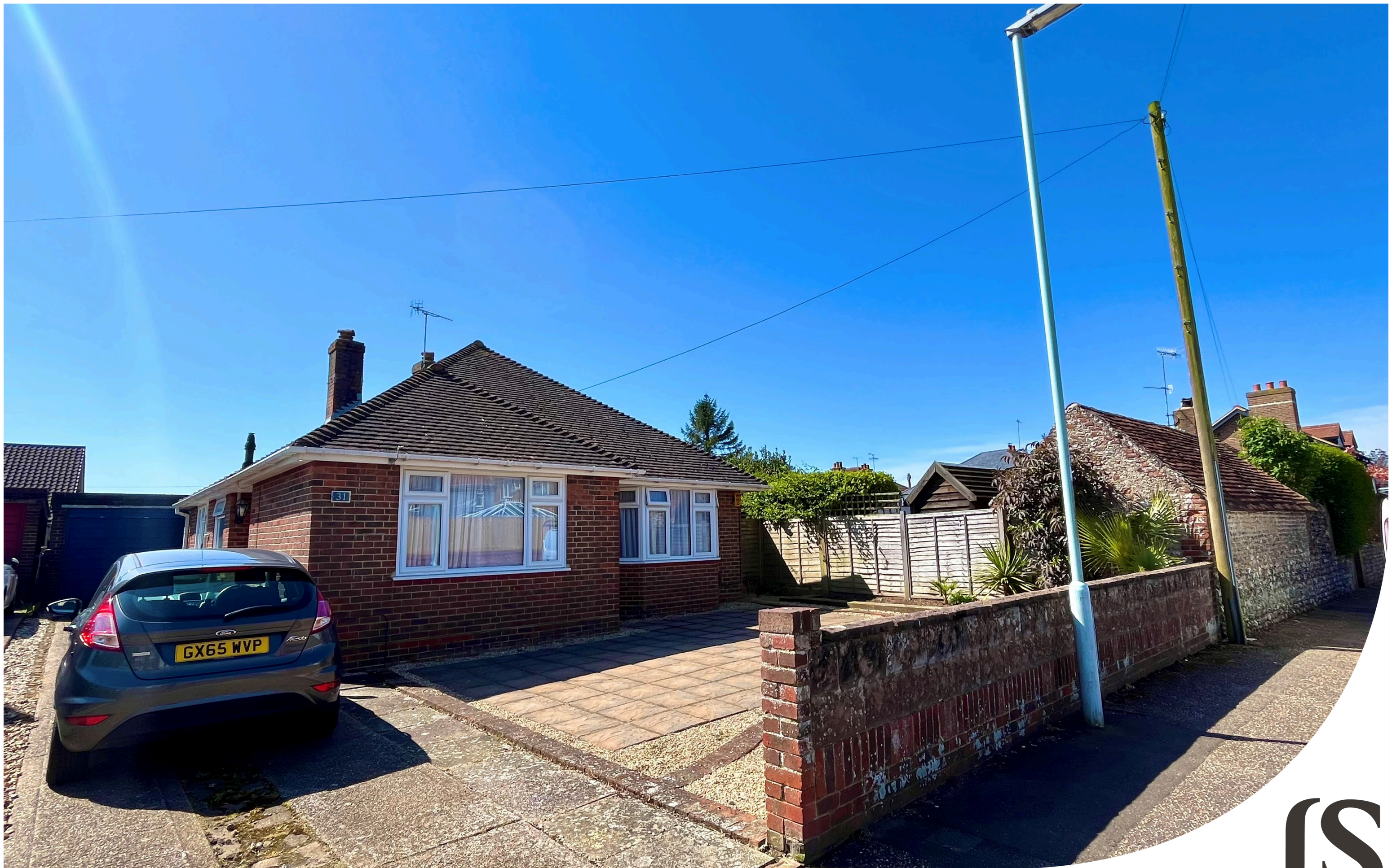
Seldens Way | Worthing | BN13 2DL Guide Price £435,000