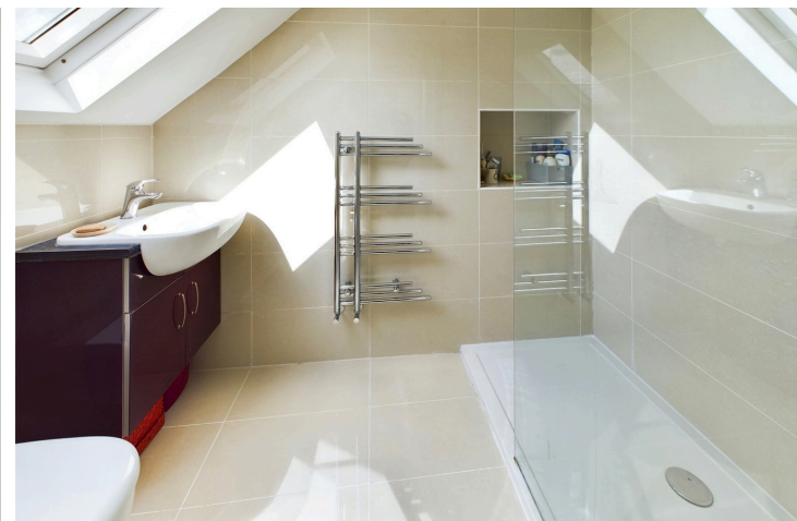
Property details: Buckingham Road | Shoreham by Sea | BN43 5UD