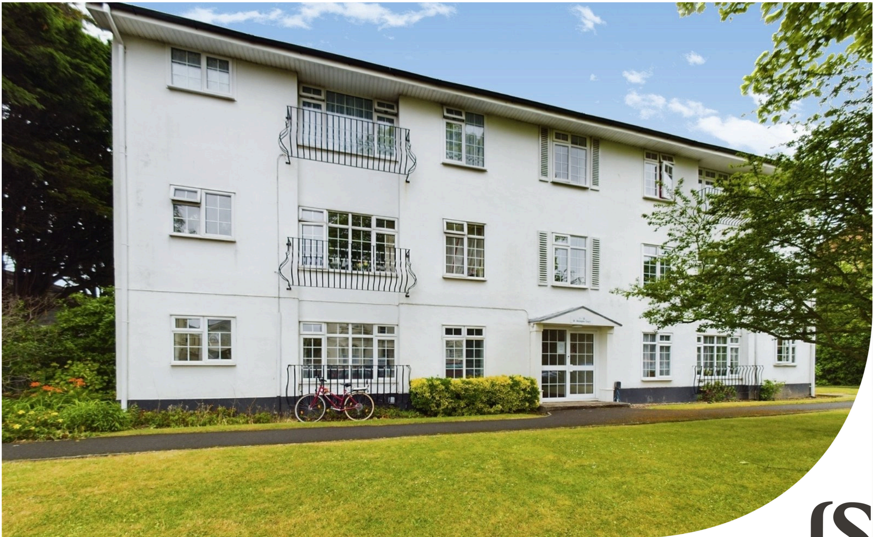
St. Botolphs Court, St. Botolphs Road, Worthing, BN11 4JH Guide Price £185,000