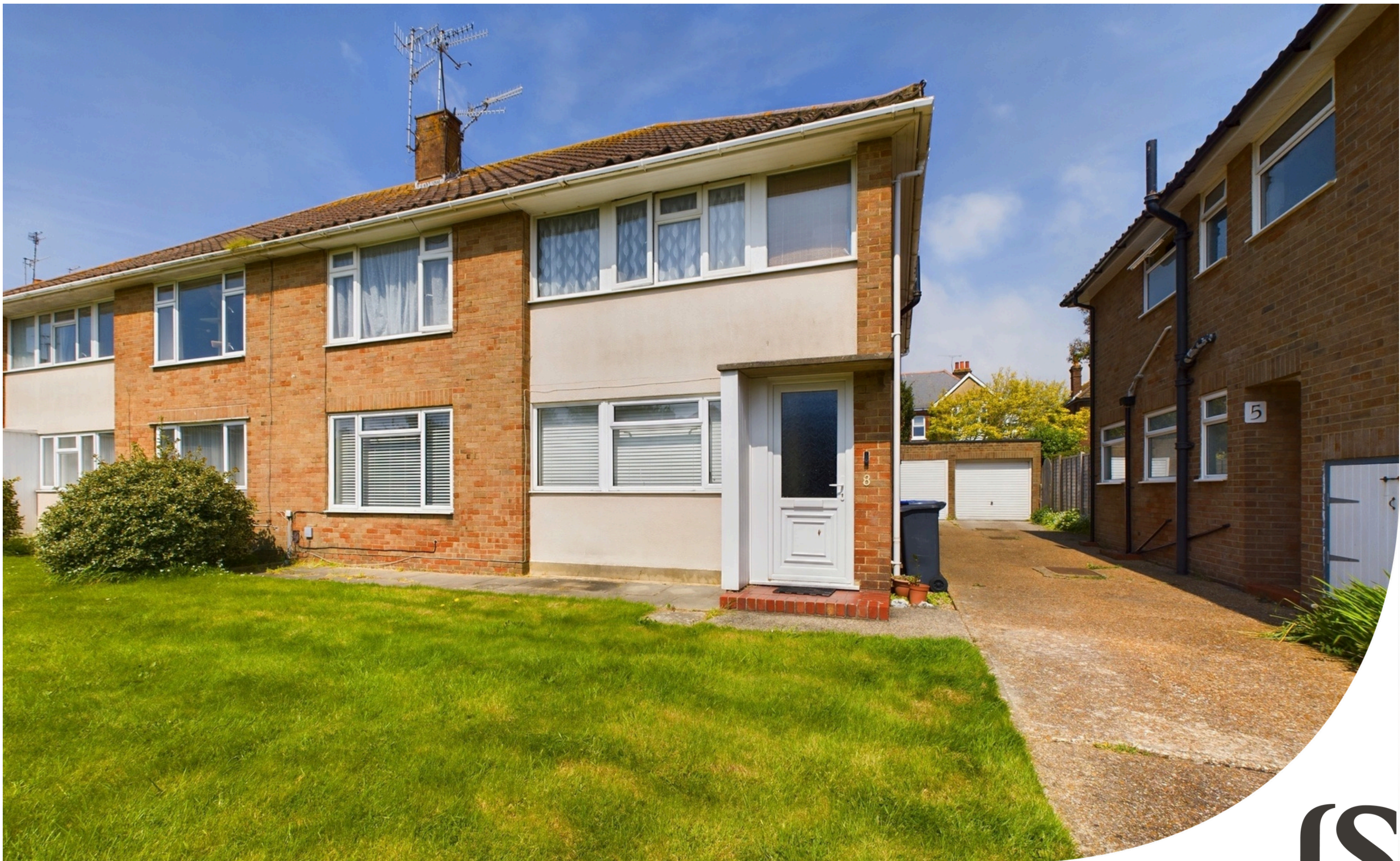
St Michaels Court, Worthing, West Sussex, BN11 4SA Asking Price Of £275,000