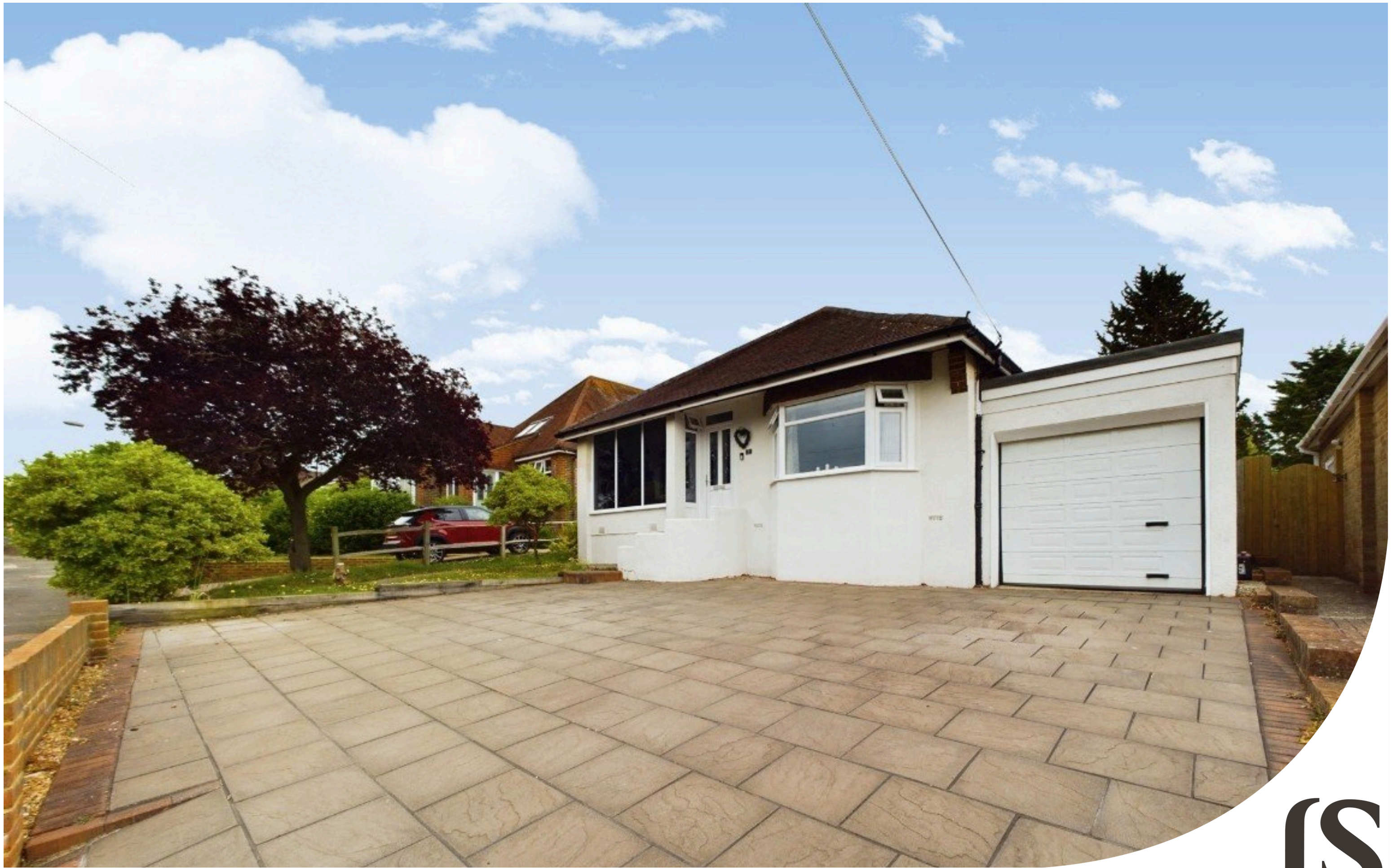
Sullington Gardens | Findon Valley | BN14 0HR Guide Price £600,000