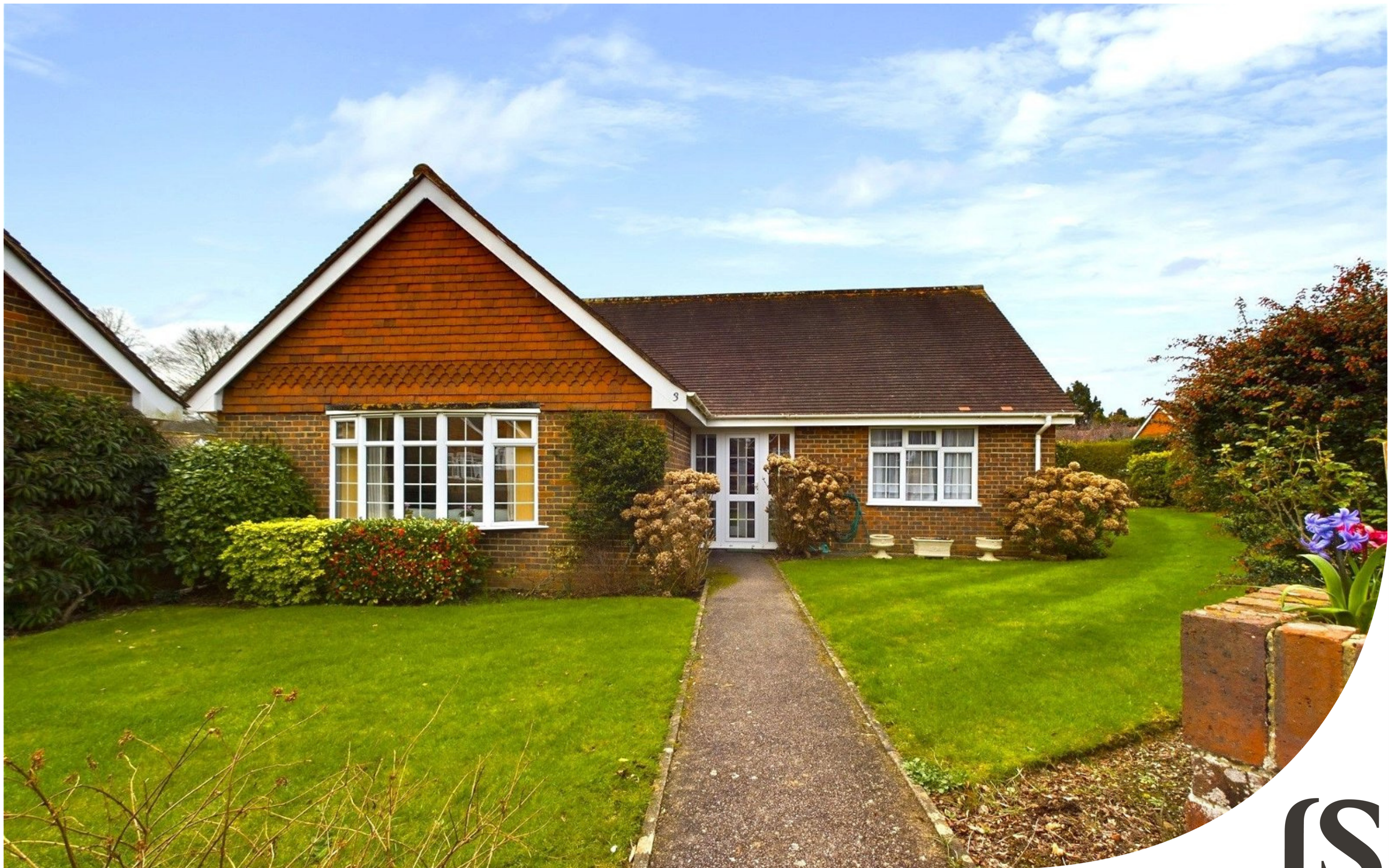
The Chase | Findon Village | BN14 0TT Guide Price £550,000