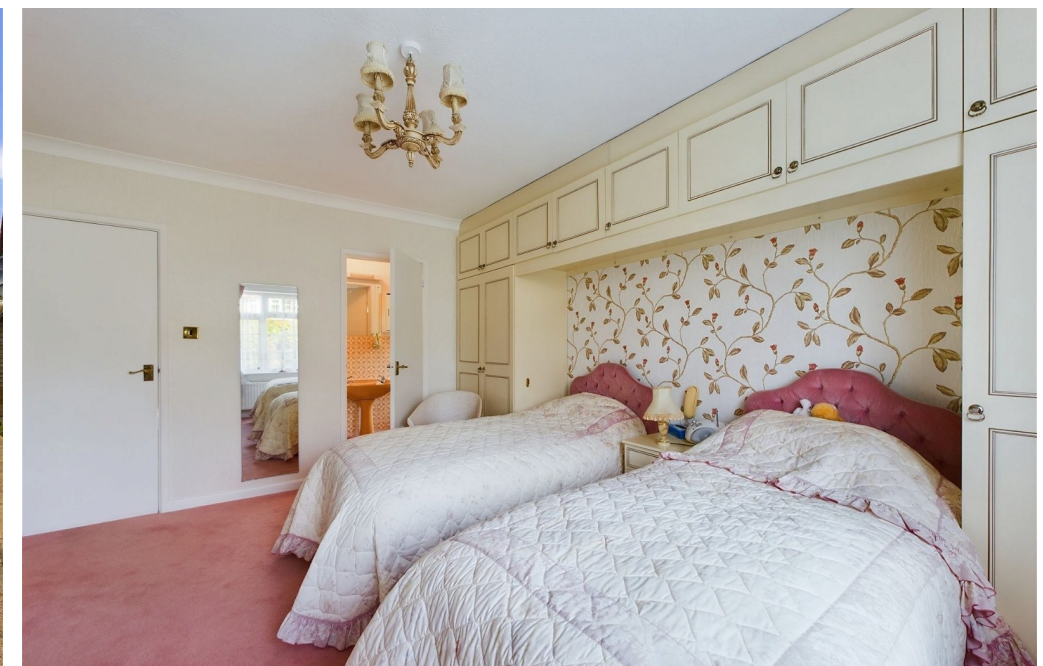
Property details: The Chase | Findon Village