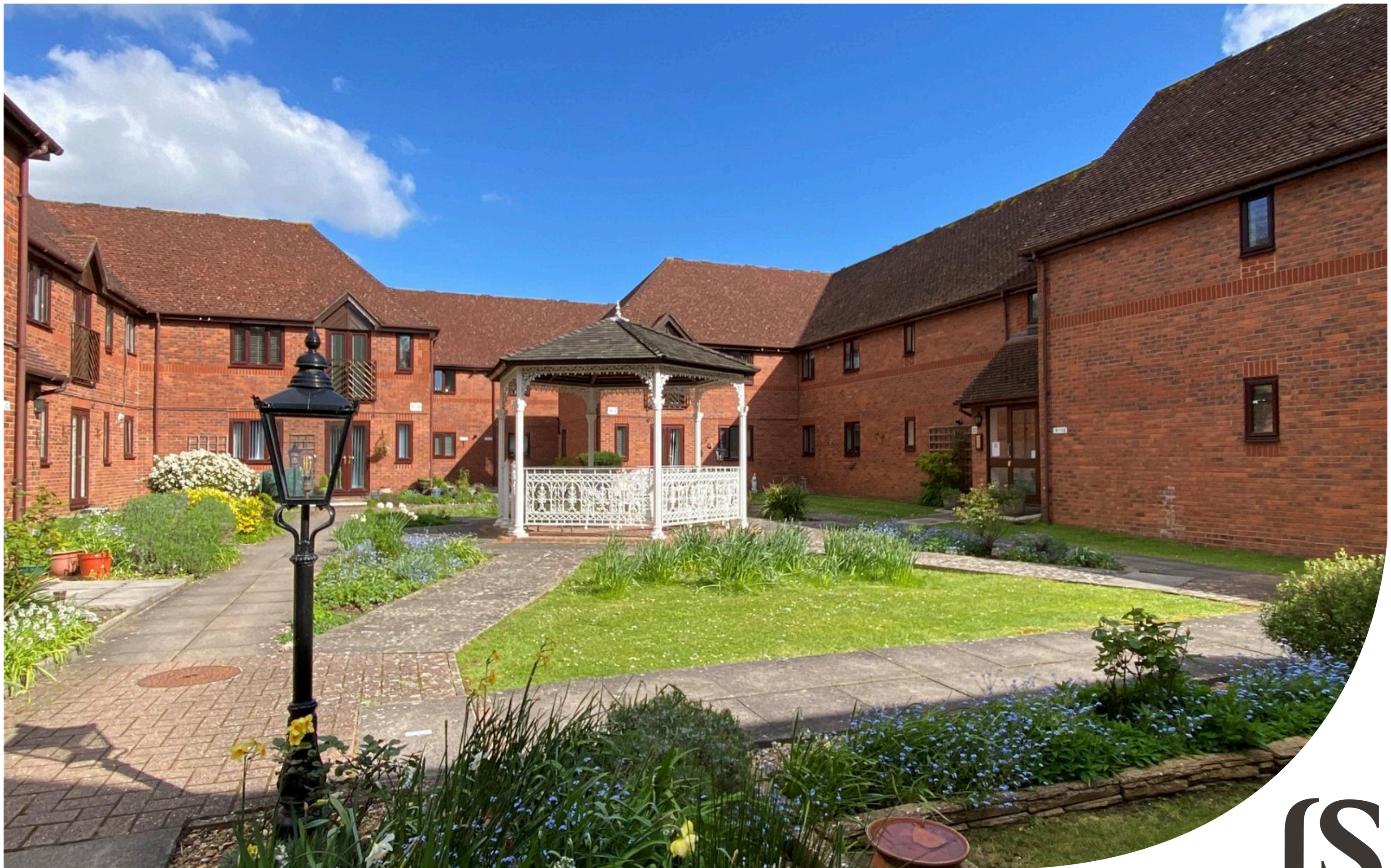
The Courtyard, Offington Lane | Worthing | BN14 9RT Guide Price £160,000