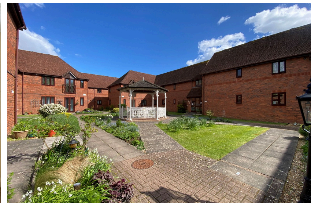
Property details: The Courtyard | Worthing