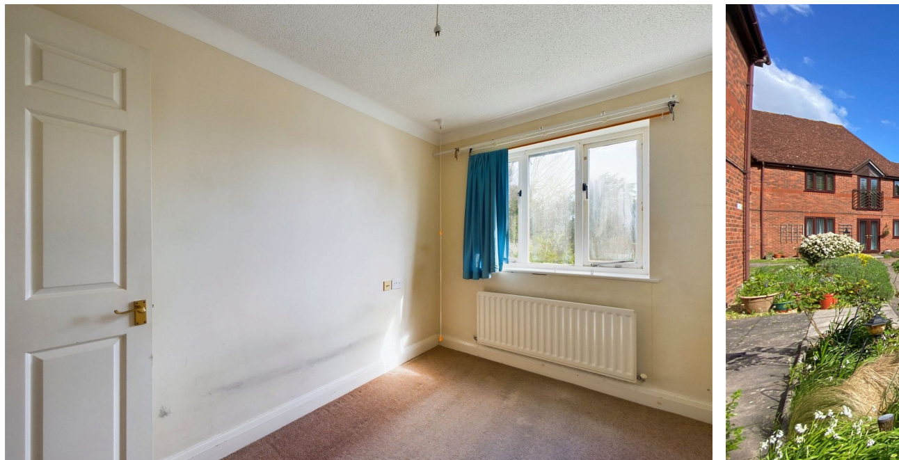
Property details: The Courtyard | Worthing

Nestled within the tranquil Offington area, this first floor retirement flat presents an ideal opportunity for those seeking convenience and community. Boasting two bedrooms, lounge/diner, fitted kitchen and bathroom, set in lovely communal gardens.