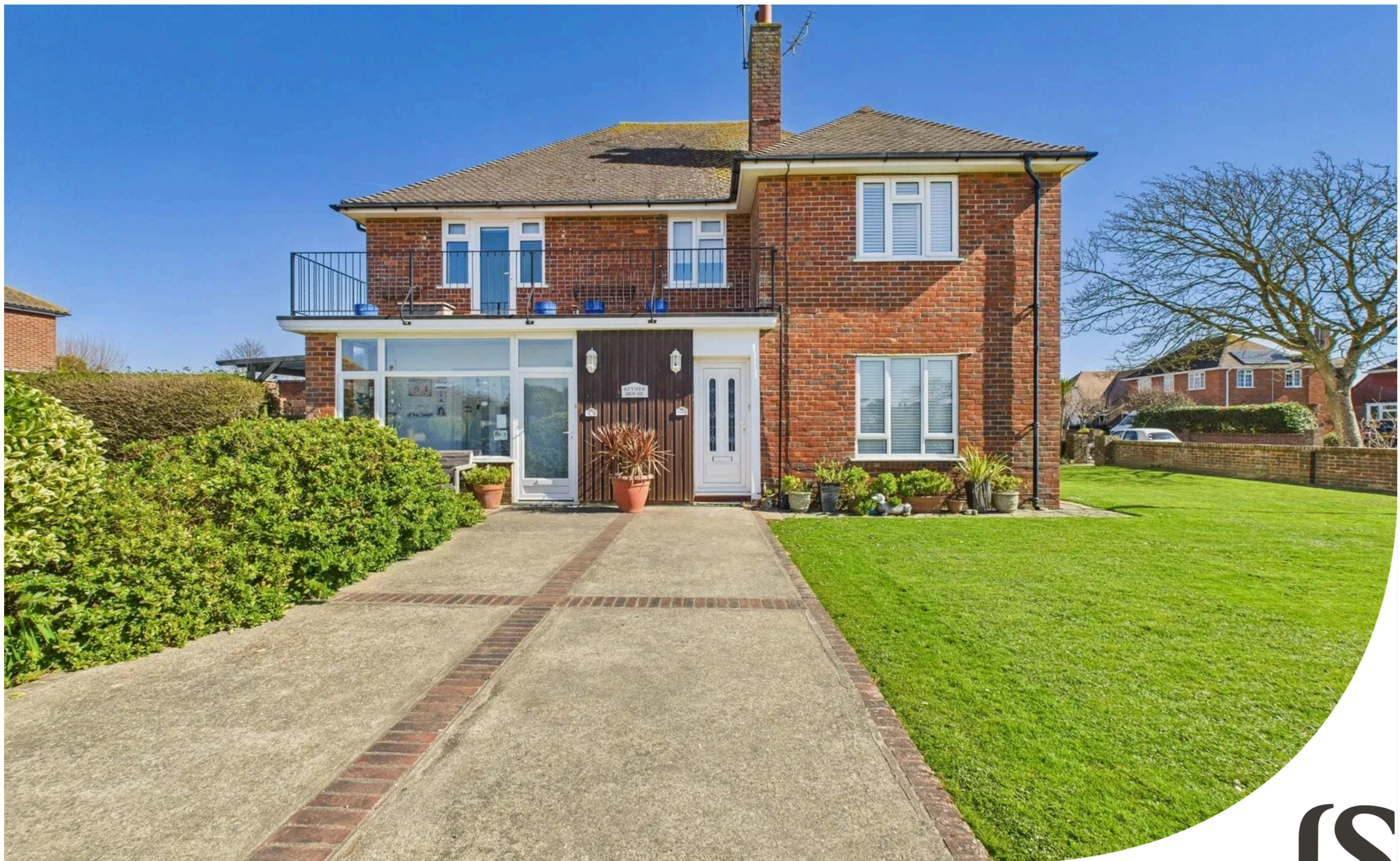
Keymer House | Nutley Avenue | Goring- By-Sea | West Sussex | BN12 4JT Offers Over £335,000