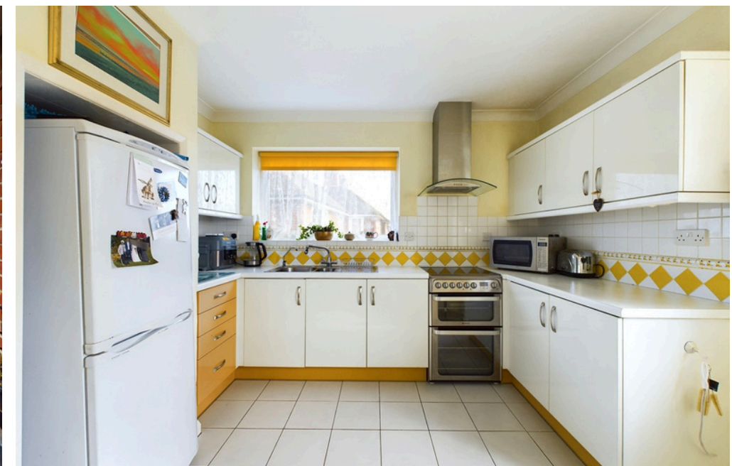
Property details: Keymer House | Nutley Avenue | Goring- By-Sea | West Sussex | BN12 4JT