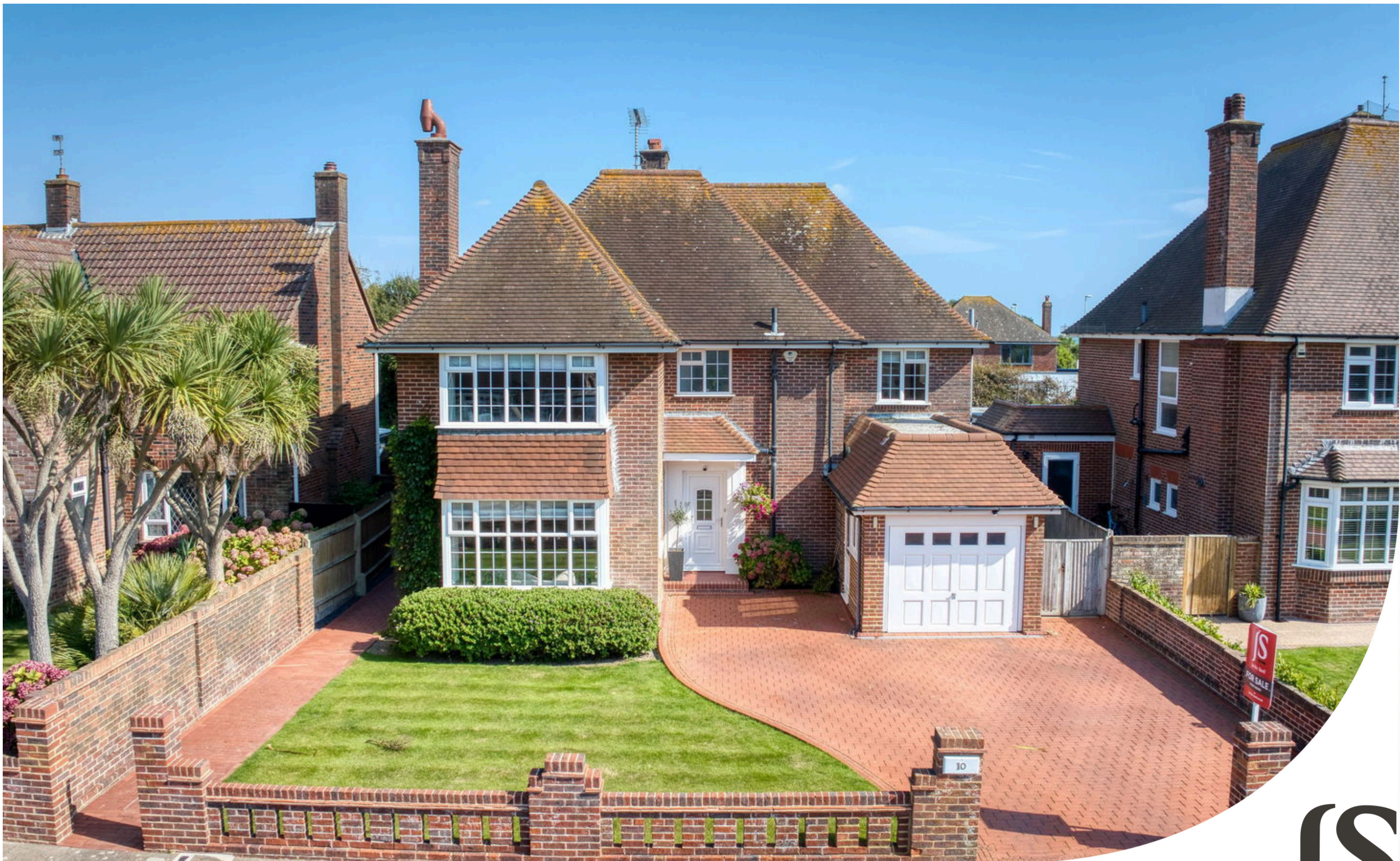
Chelwood Avenue | Goring-By-Sea | West Sussex | BN12 4QP Guide Price Of £950,000