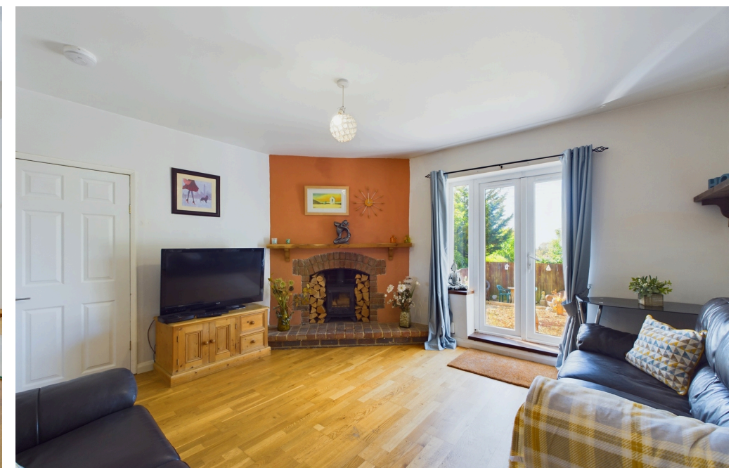
Property details: Crockhurst Hill | Worthing