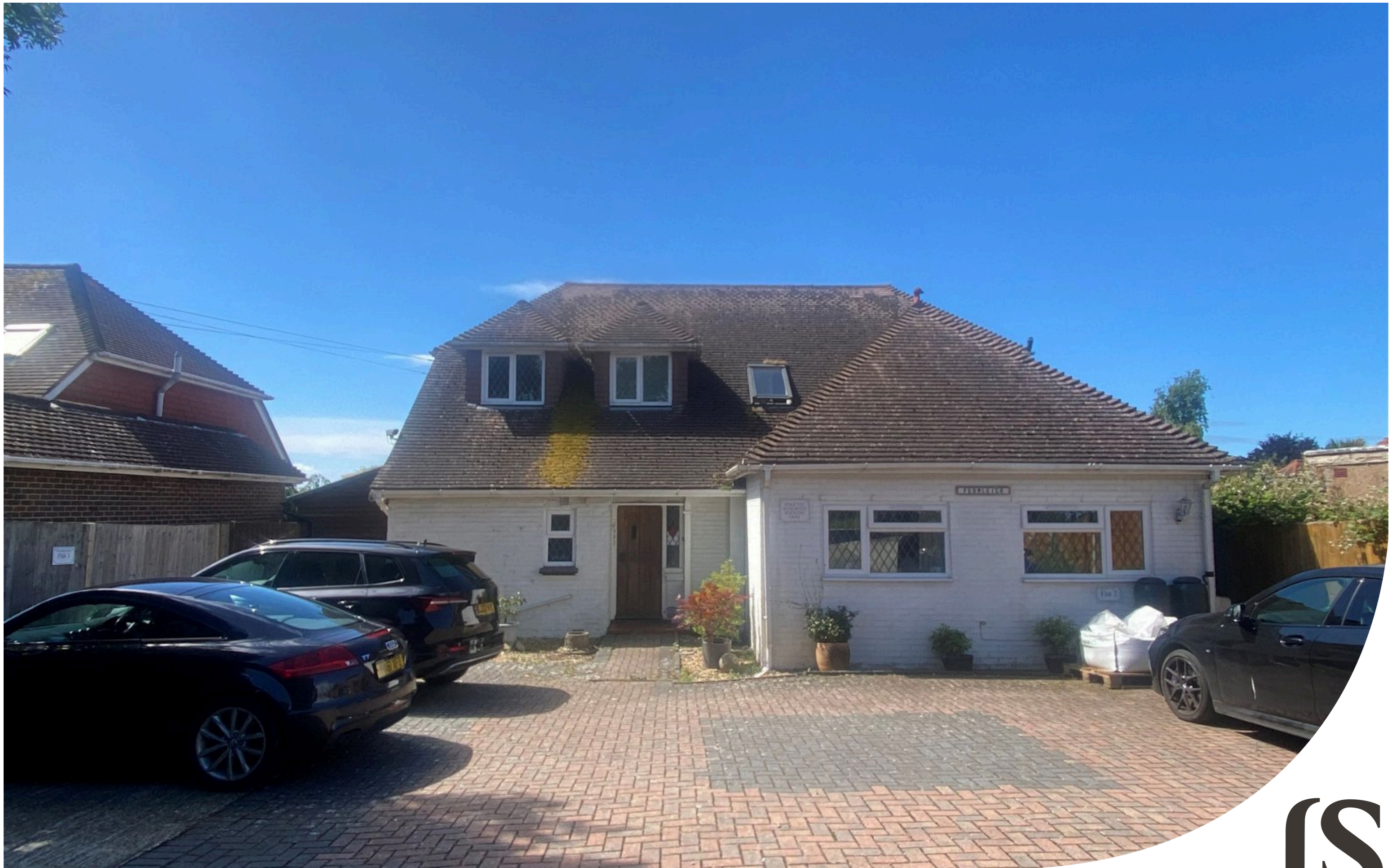
Crockhurst Hill | Worthing | BN13 3EE Guide Price £215,000