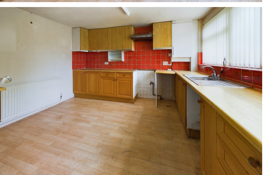
Property details: Rowan Close | Portslade | BN41 2PT