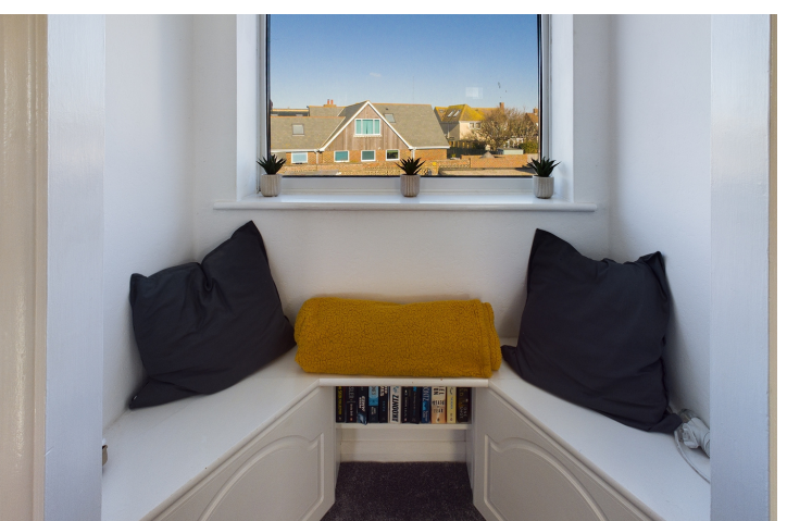
Property details: Old Fort Road | Shoreham by Sea | BN43 5HL