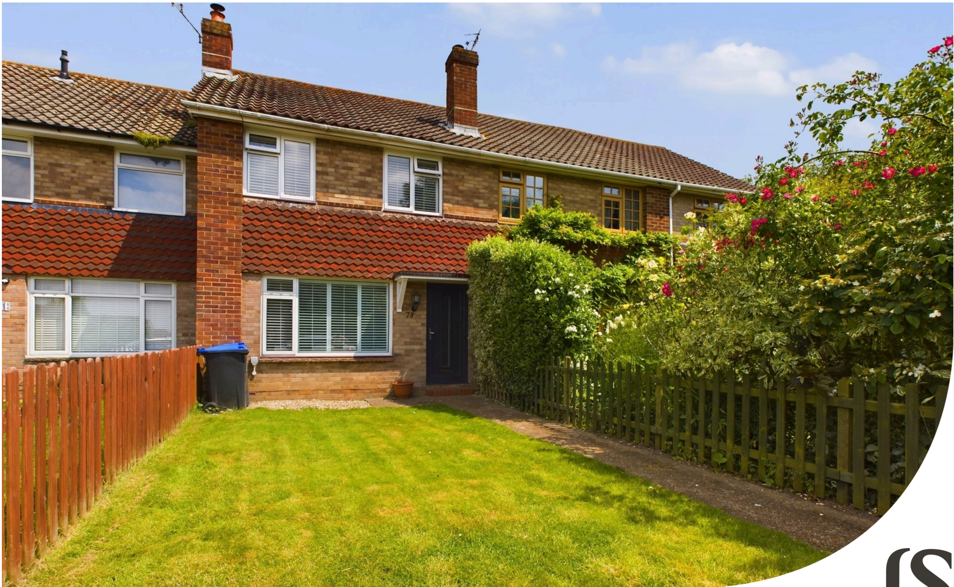
73 Stonehurst Road, Worthing, BN13 1NJ Offers Over £350,000