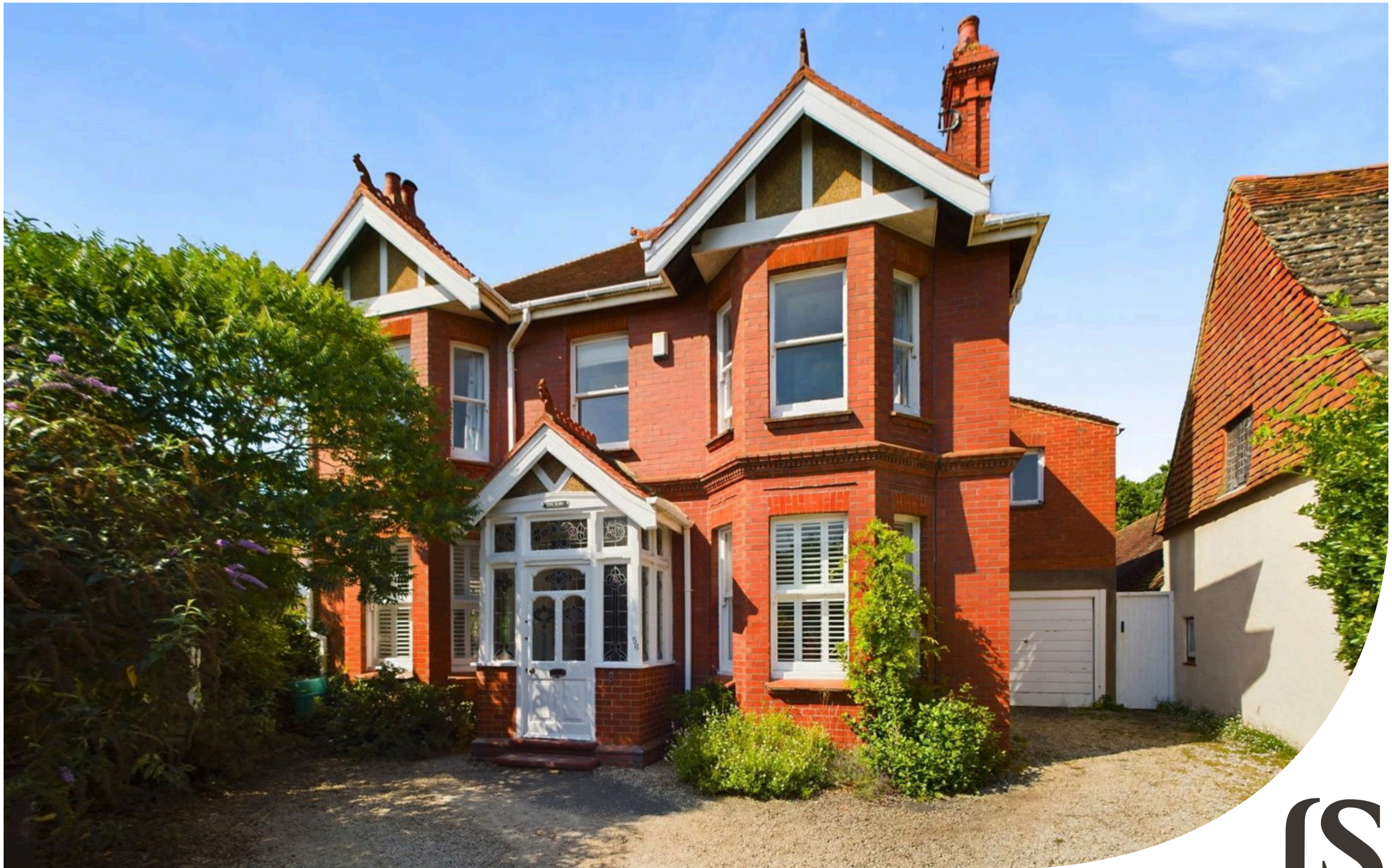
Ashacre Lane | Worthing | BN13 2DE Guide Price £750,000