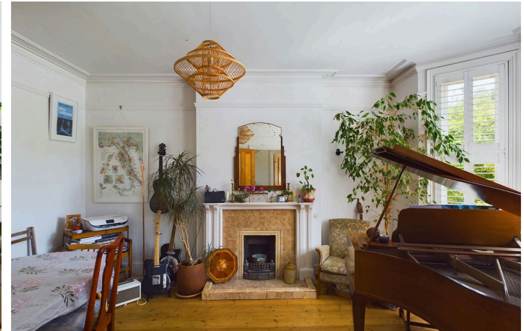
Property details: Ashacre Lane | Worthing