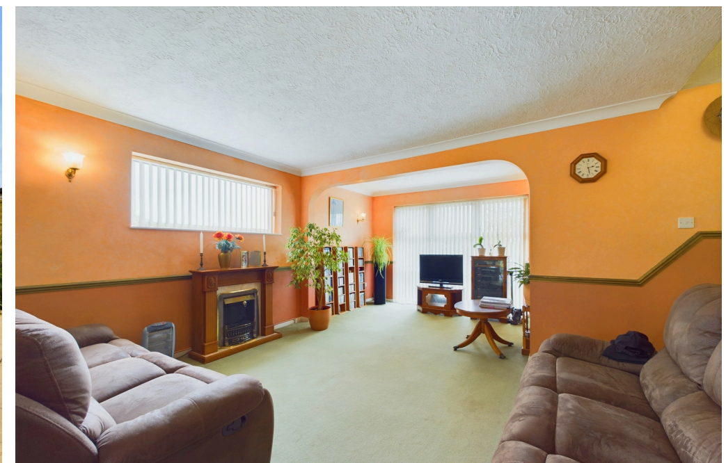
Property details: Hayling Rise, High Salvington | Worthing