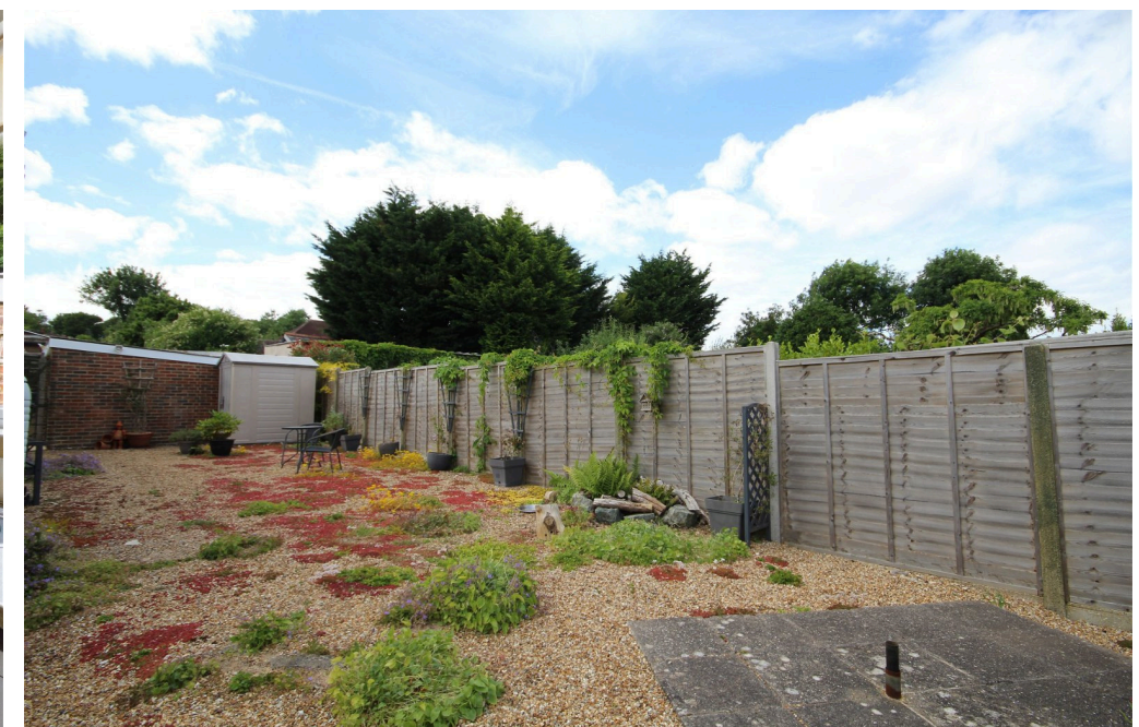
Property details: Greatham Road | Findon Valley