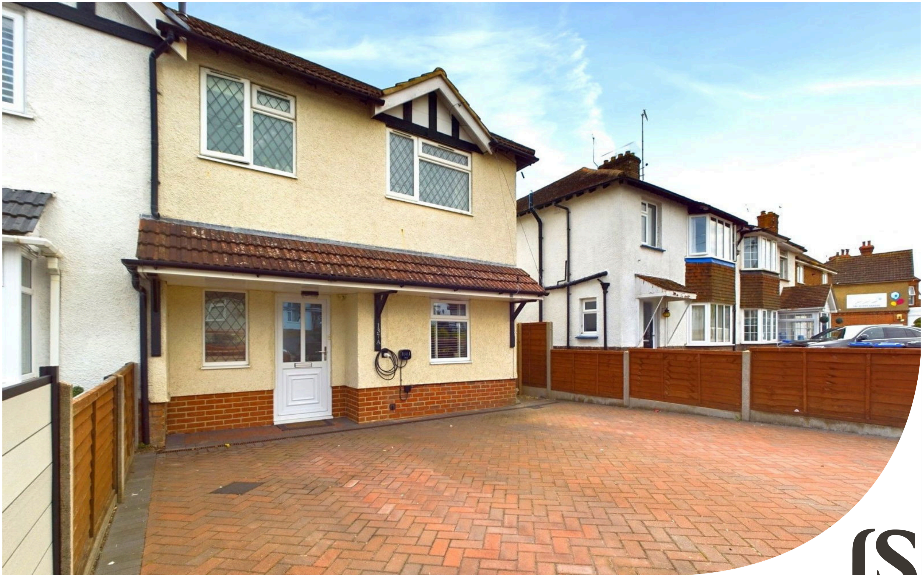
Salvington Road | Worthing | BN13 2JN Guide Price £470,000