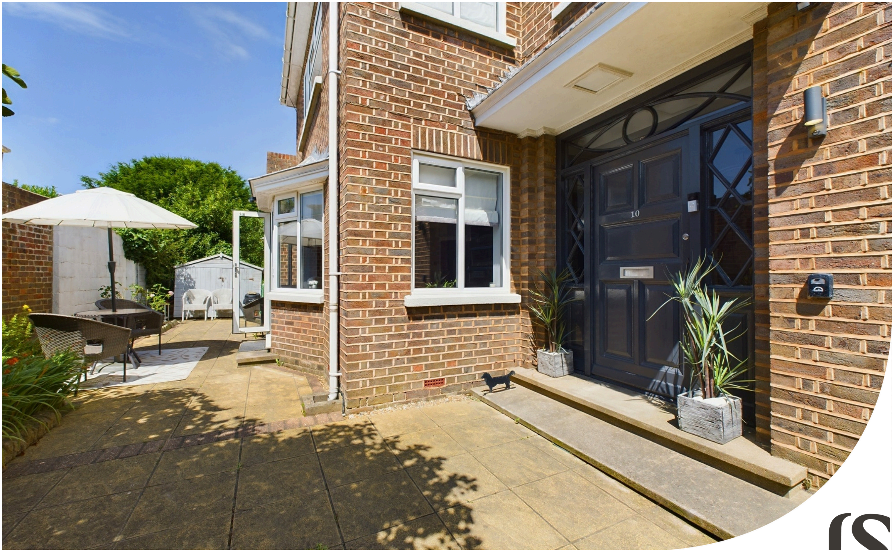
St. Raphael Road, Worthing, BN11 5HL Asking Price Of £425,000