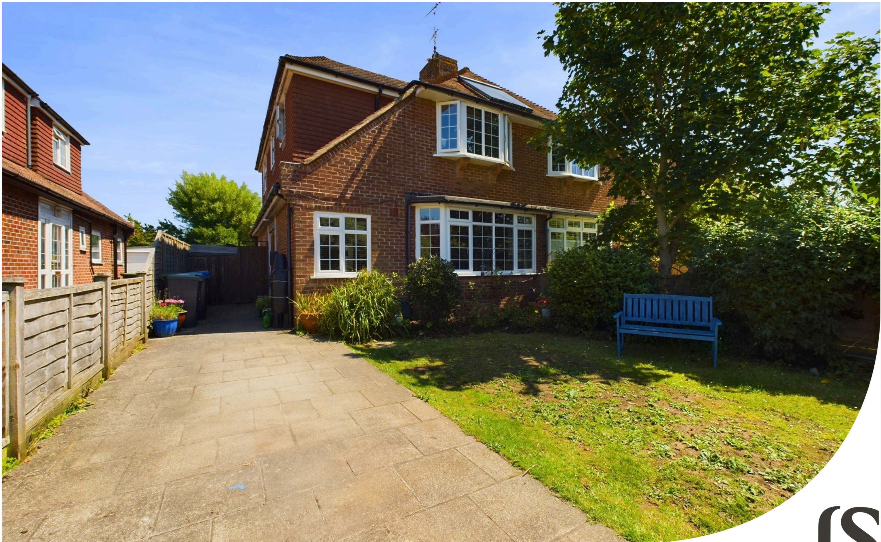
Rose Walk, Goring-by-sea, Worthing, BN12 4AU Guide Price £600,000