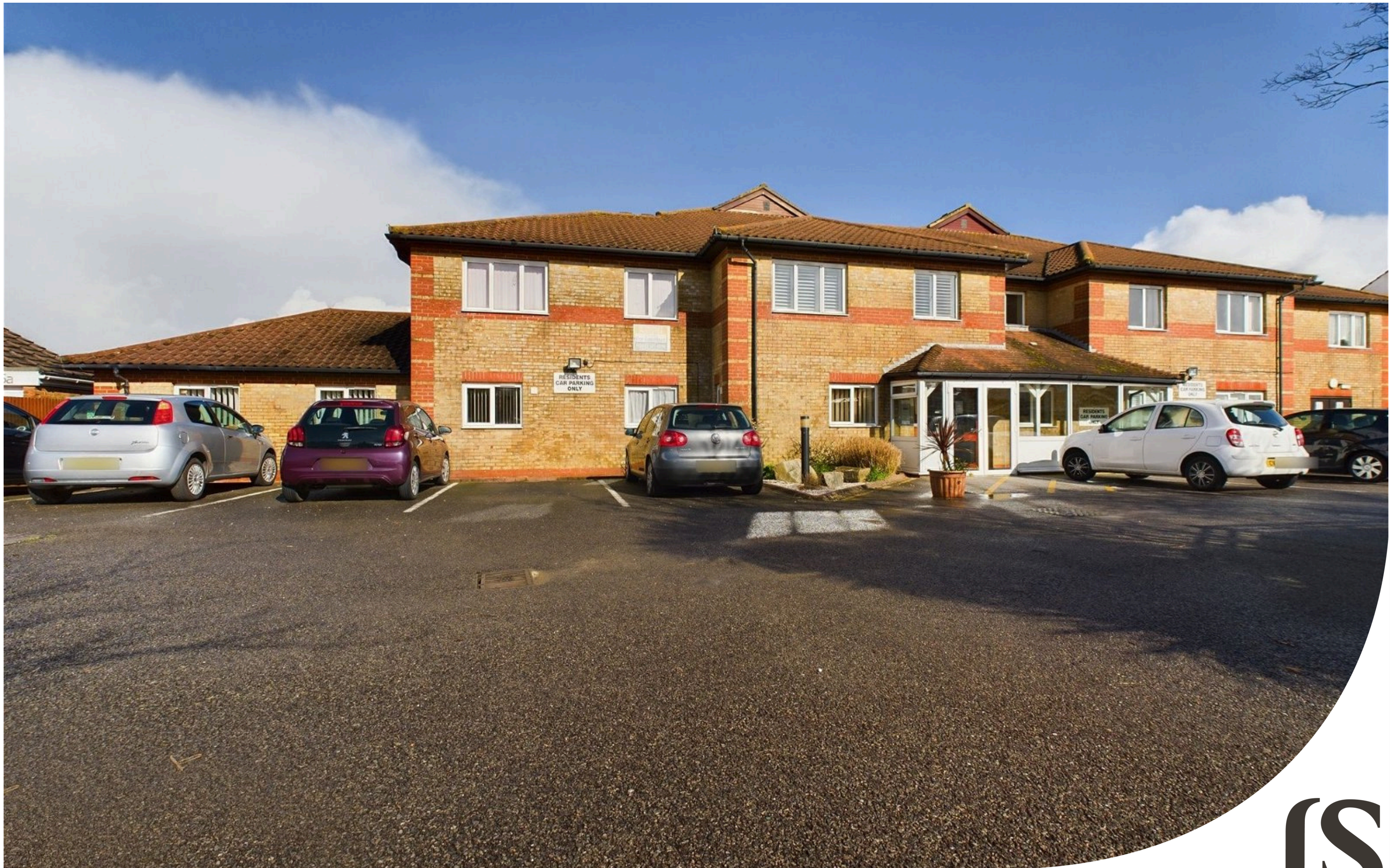
Amberley Court, 27, Freshbrook Road, Lancing, BN15 8DS Offers Over £73,500