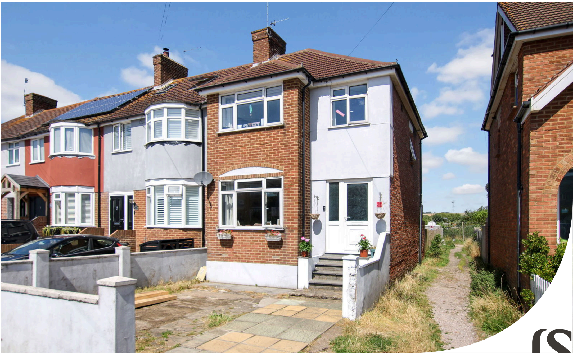
Mansfield Road | East Worthing | Worthing | BN11 2QN Guide Price £400,000