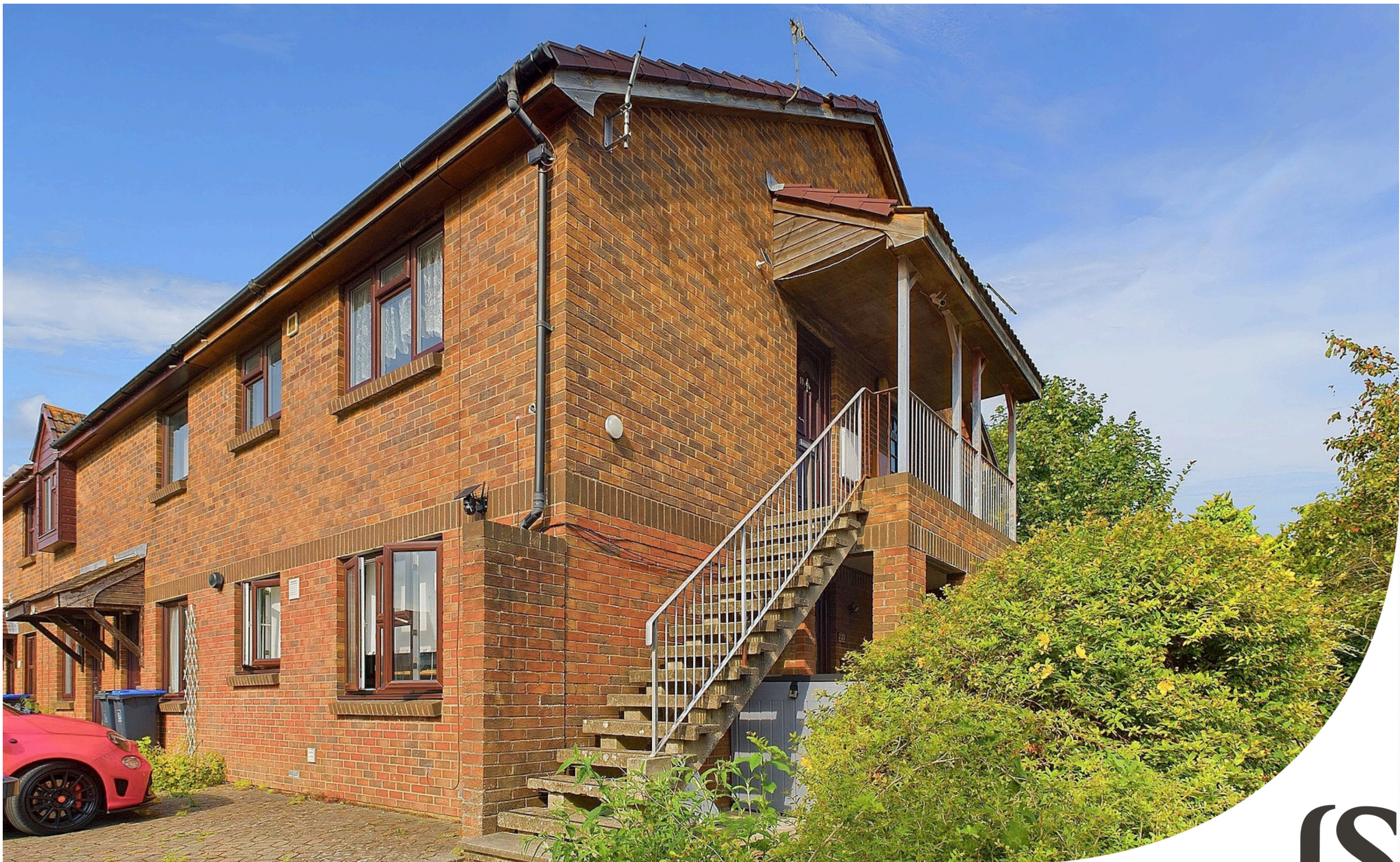
Pilgrims Walk, Worthing, BN13 1RJ Asking Price of £137,000