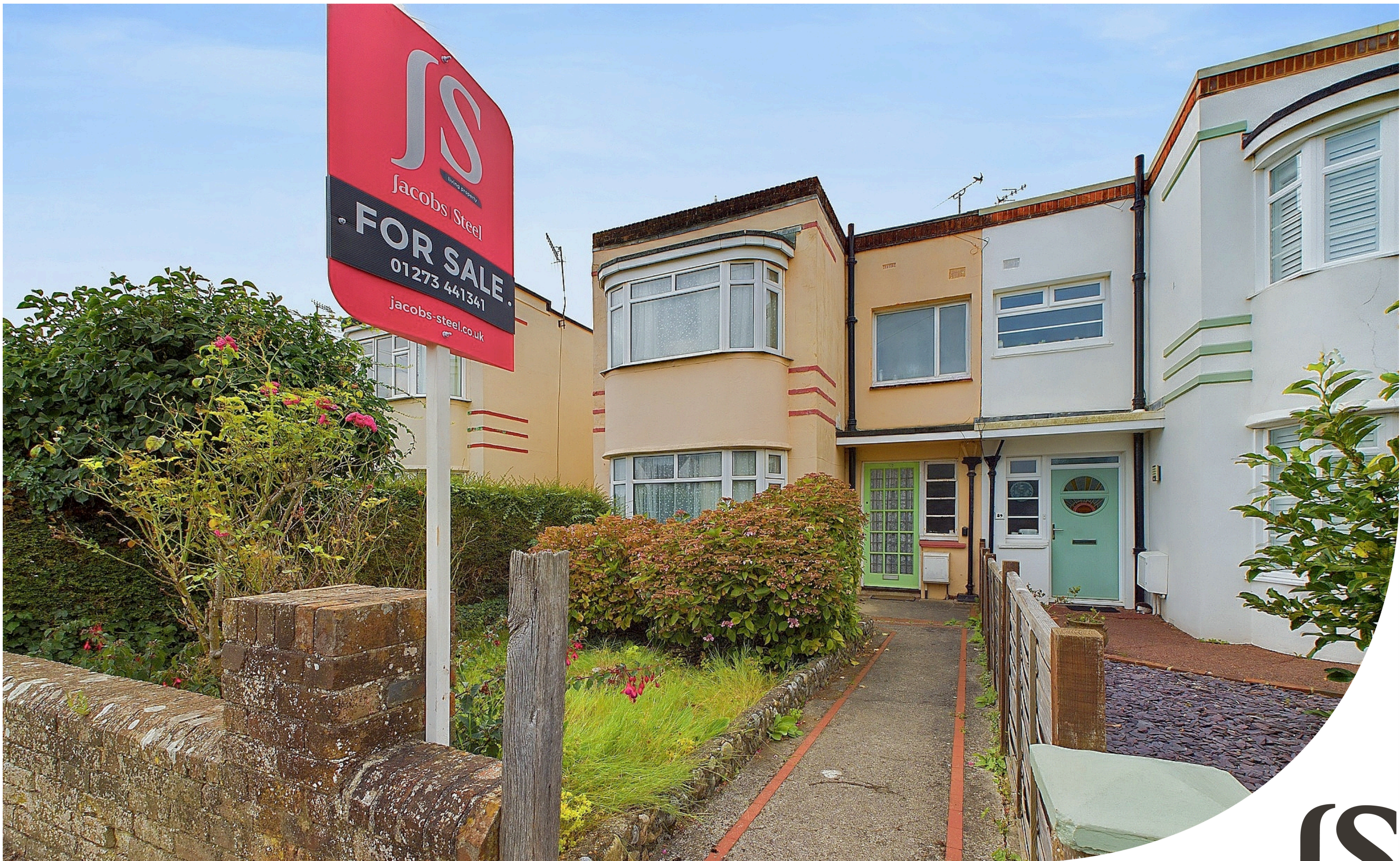
Victoria Road | Shoreham by Sea | BN43 5WR Guide Price £499,950