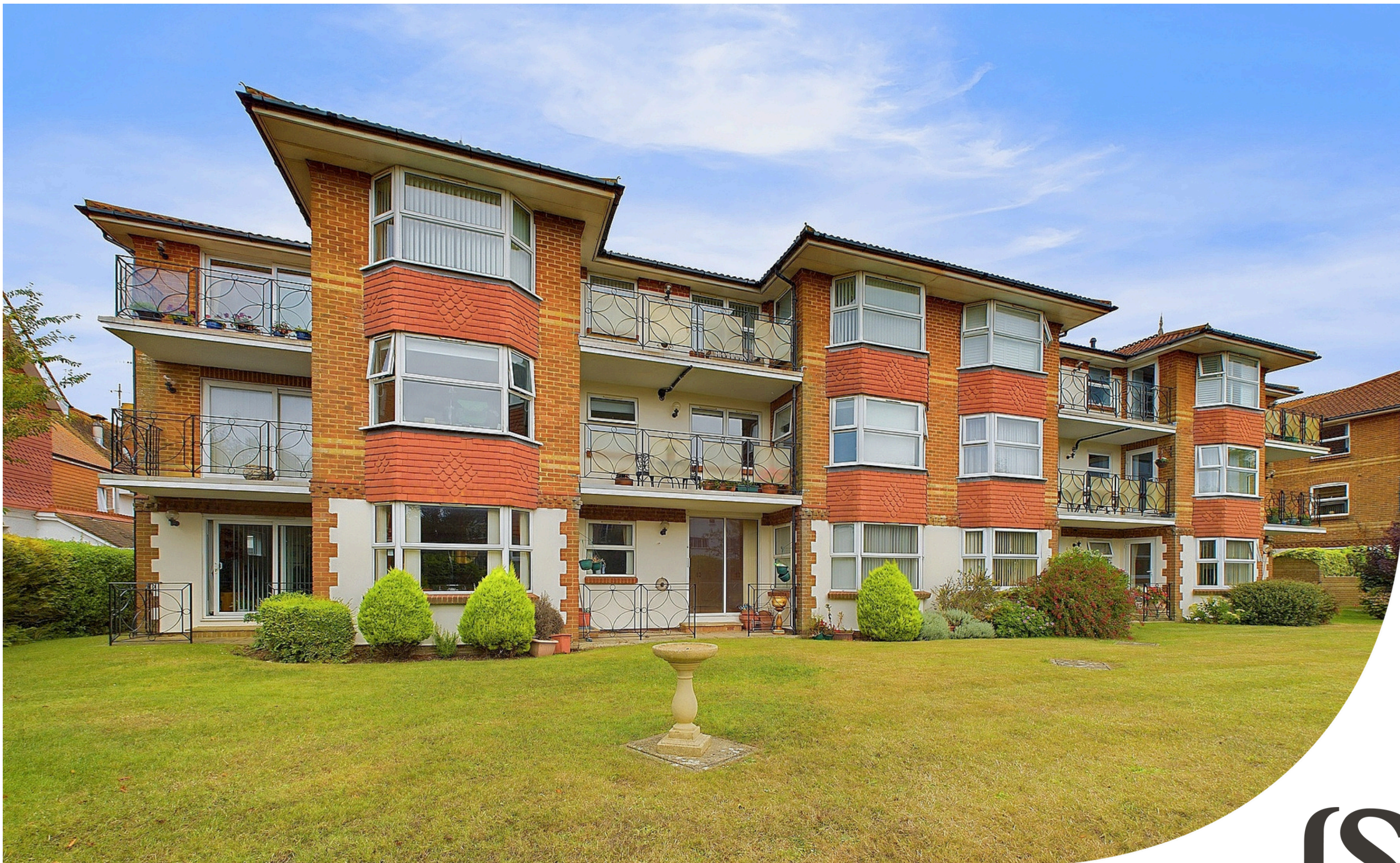
Westmead Gardens, West Avenue, Worthing, BN11 5LP Asking Price £325,000