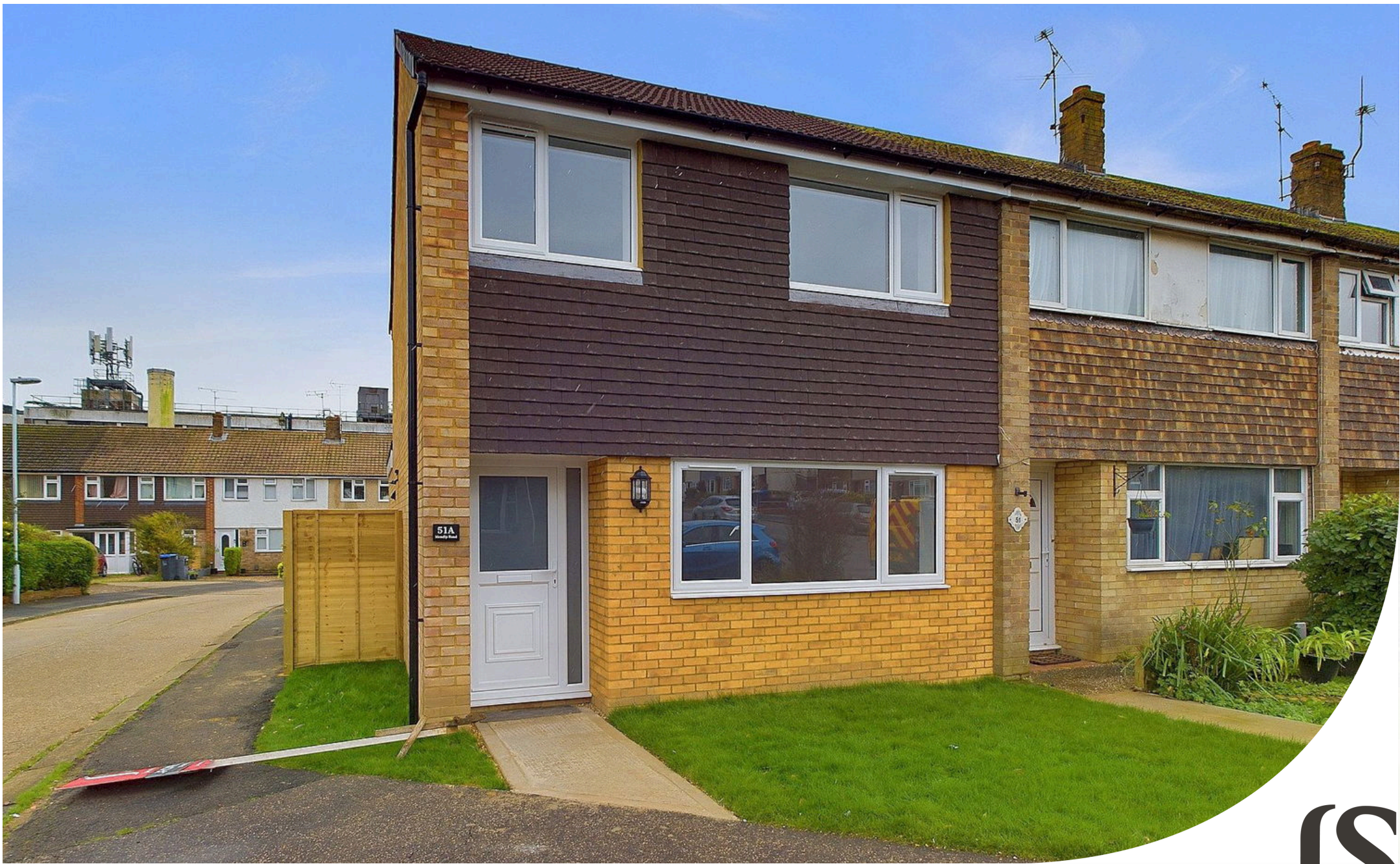
51a Mendip Crescent | Salvington | Worthing | BN13 2LR Asking Price £325,000