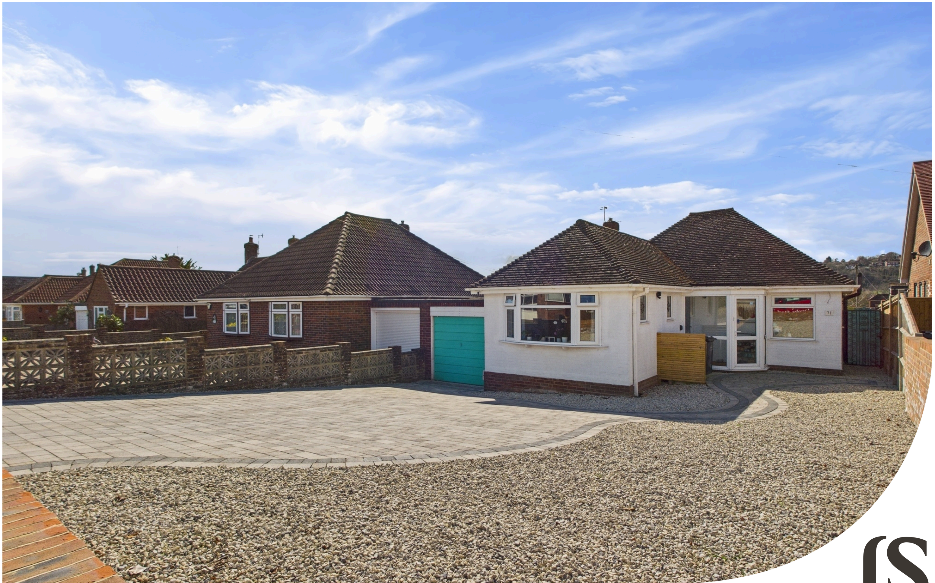
Hollingbury Gardens | Findon Valley | BN14 0EB Guide Price £585,000