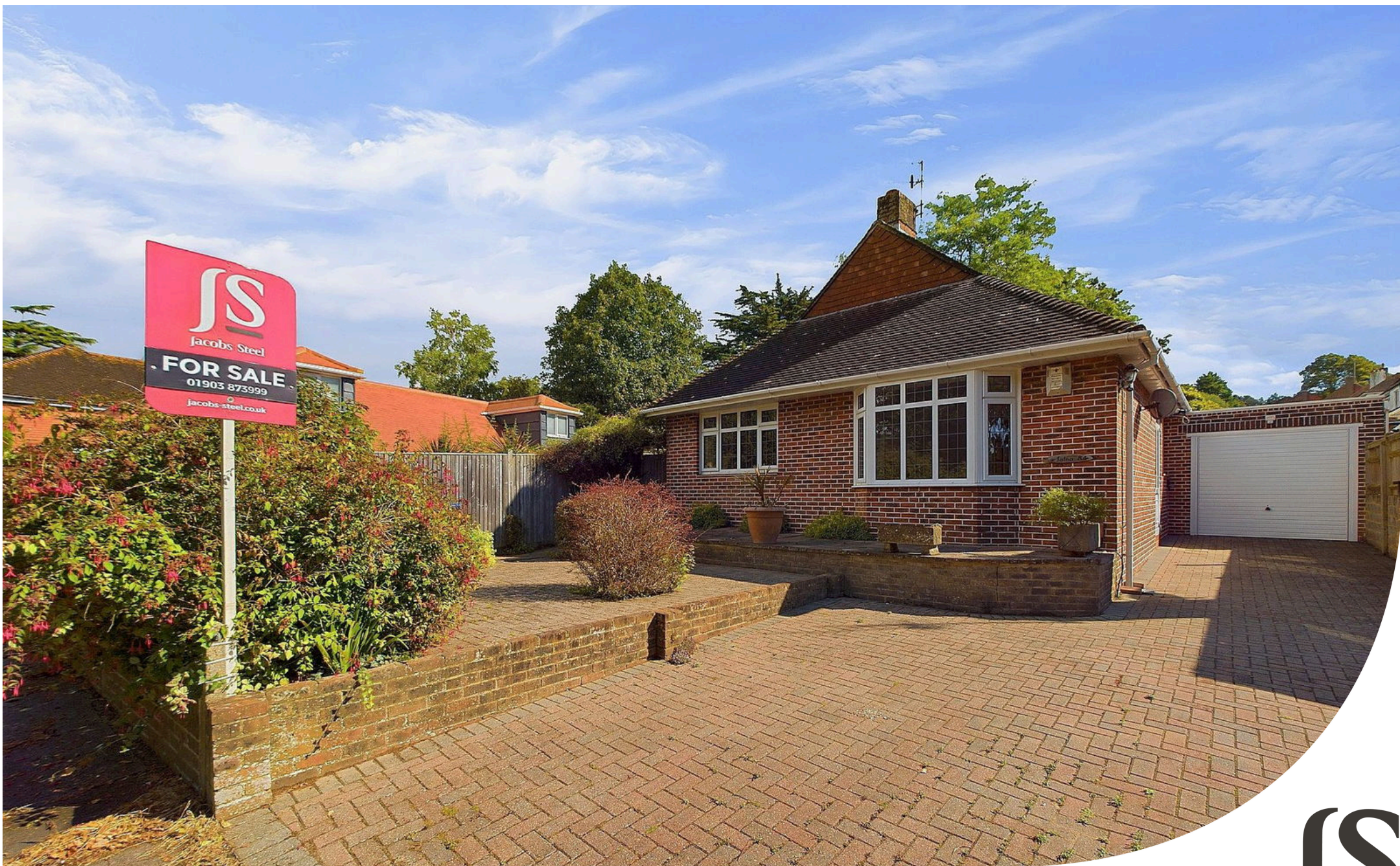
Findon Road | Findon Valley | Worthing | BN14 0AQ Guide Price £525,000