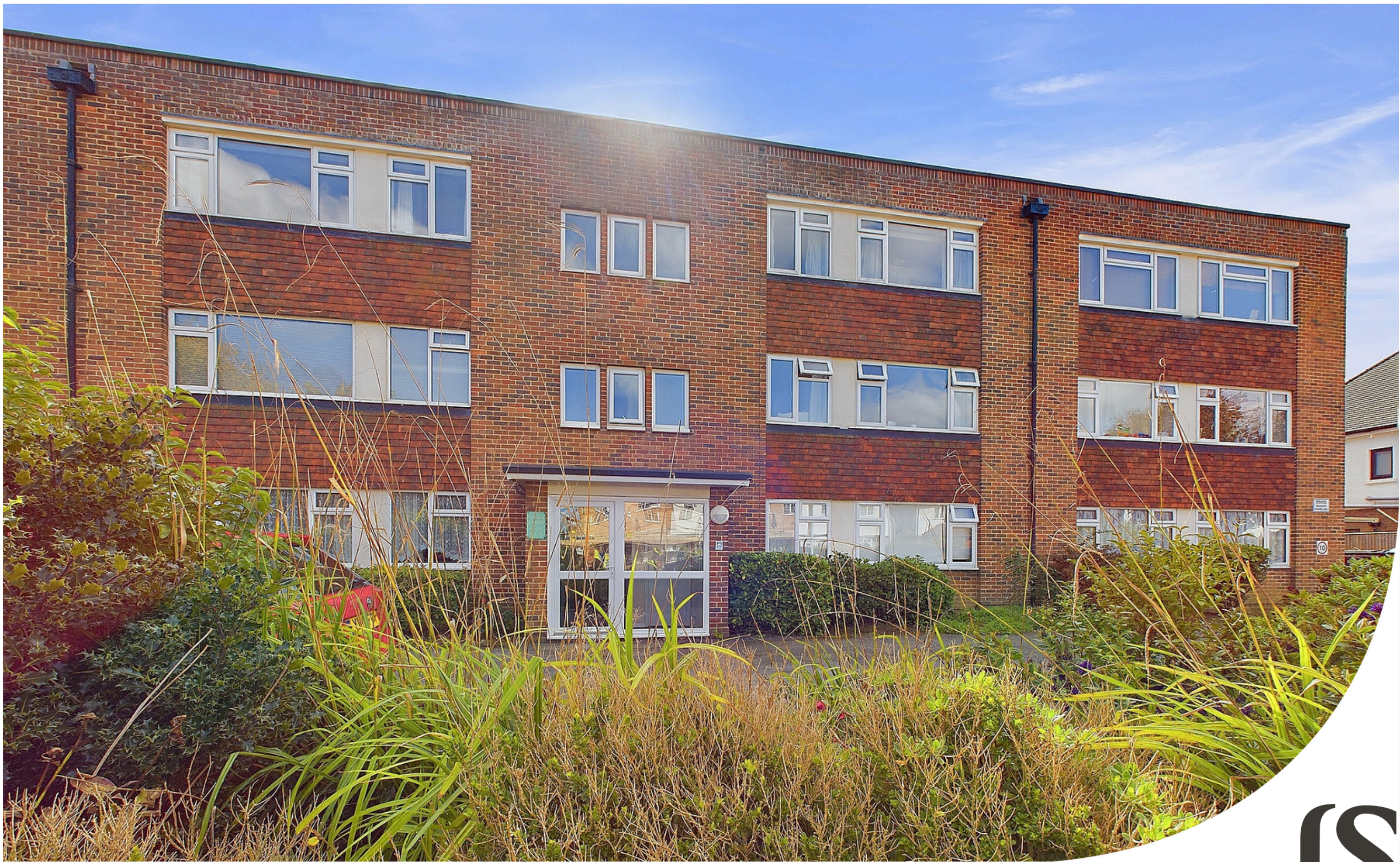
Davies Court, Hythe Road, Worthing, BN11 5DQ Asking Price £240,000