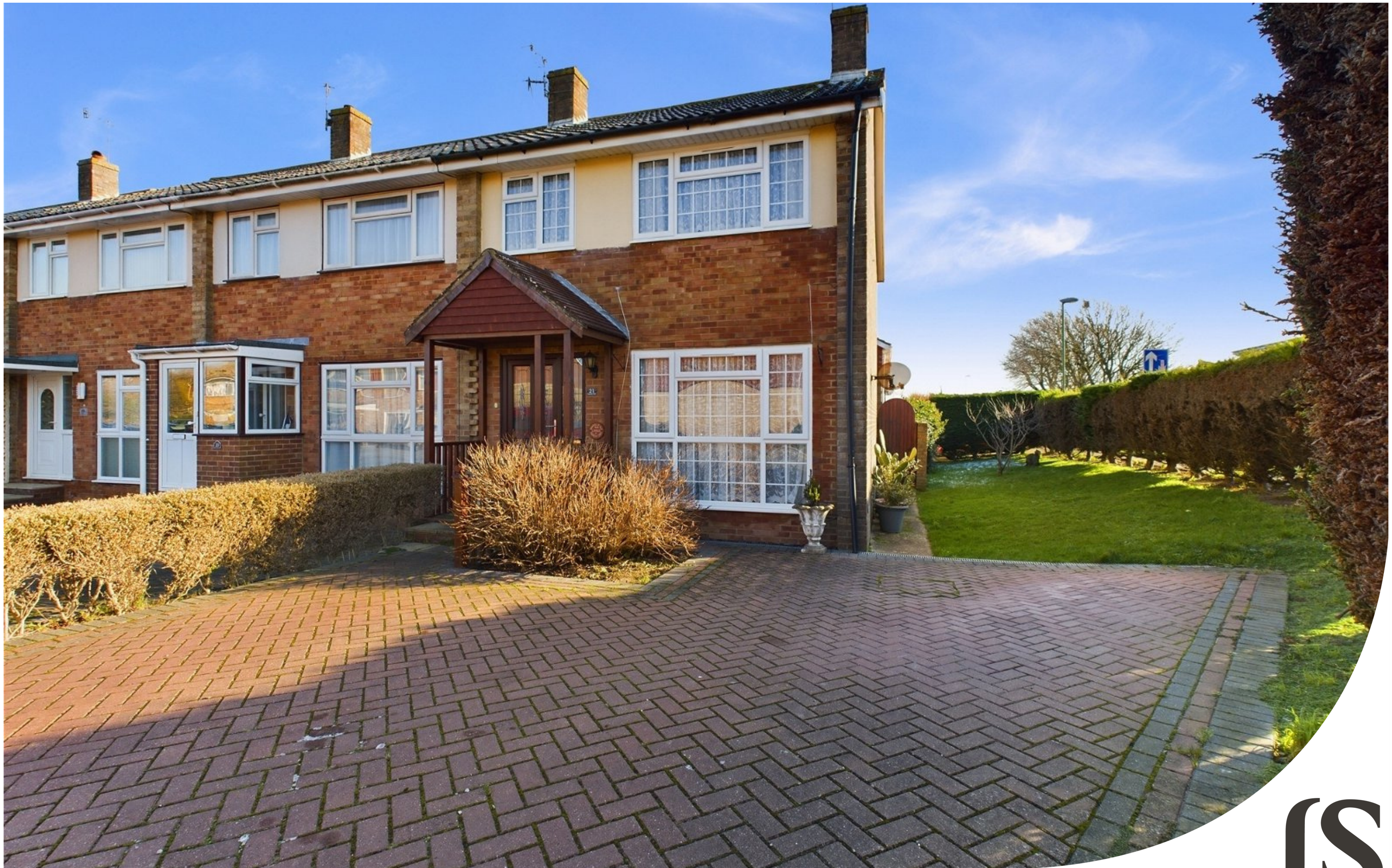
Larkfield Close, Lancing, BN15 8DP Offers Over £375,000