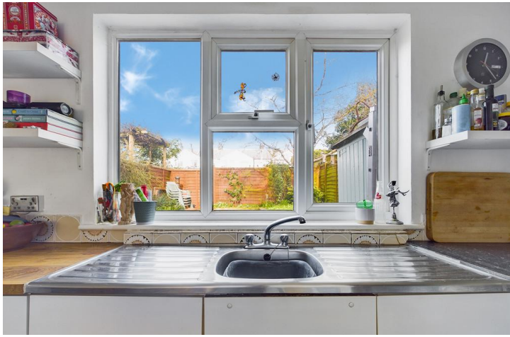
Property details: Sheridan Terrace | Hove | BN3 5AF