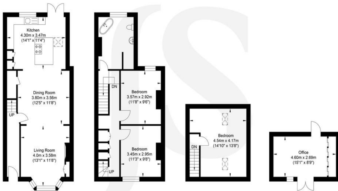
Ground Floor Approximate Floor Area 525.81 sq ft (48.85 sq m)