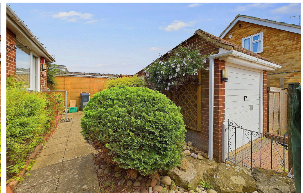
Property details: Moorfoot Road | Salvington