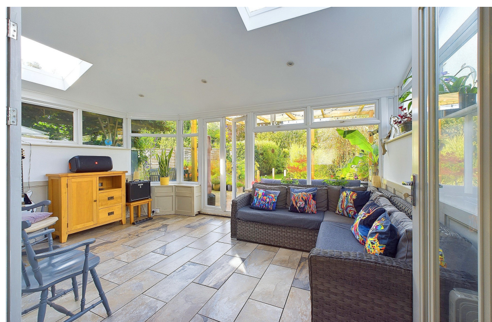
Property details: Old Shoreham Road | Southwick | BN42 4LR