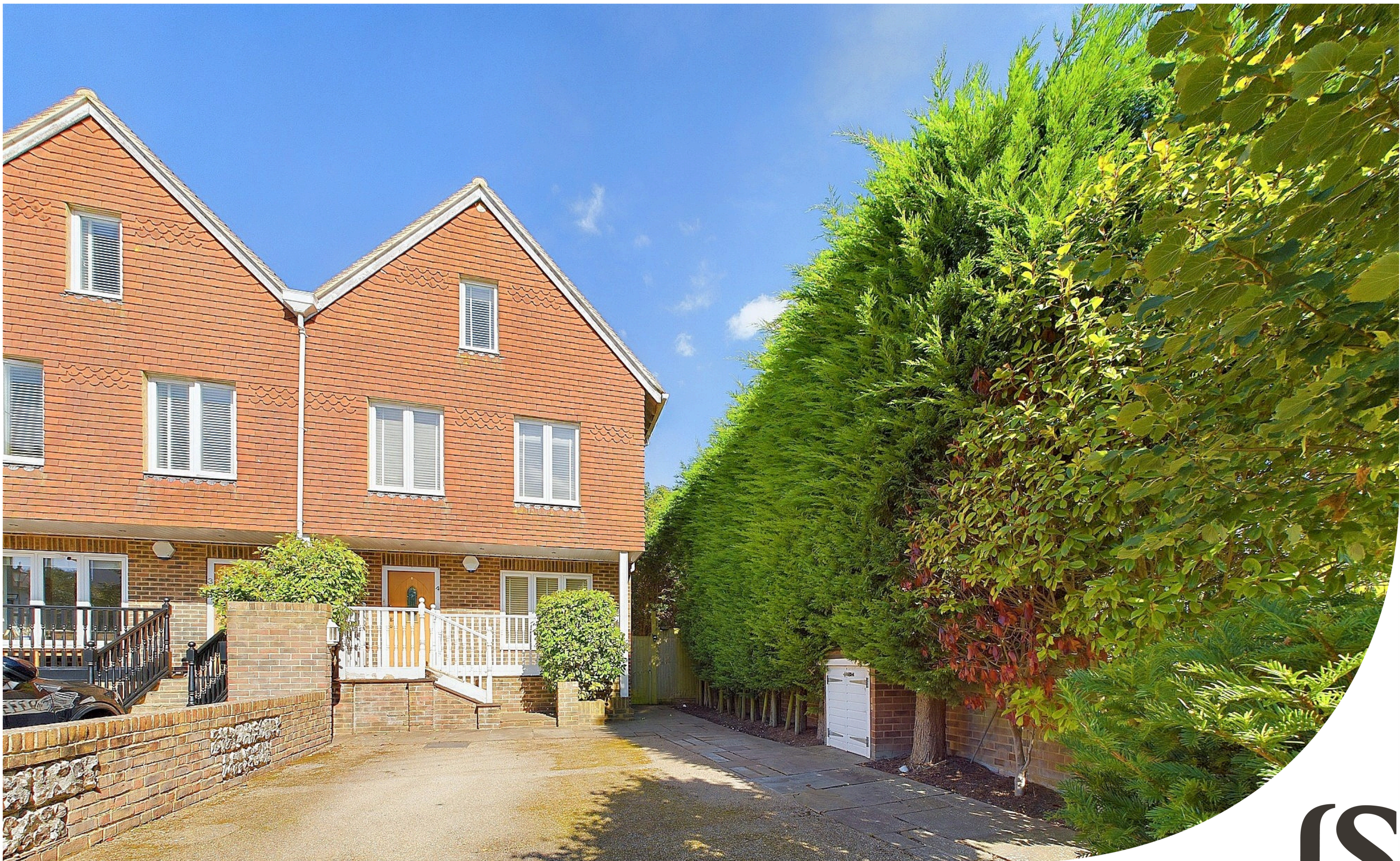
Castle View, The Street | Bramber, Steyning | BN44 3WE Guide Price £750,000