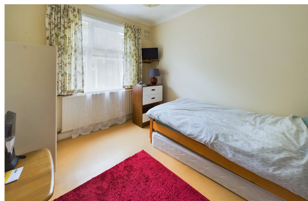
Property details: Greenways | Southwick | BN42 4QJ