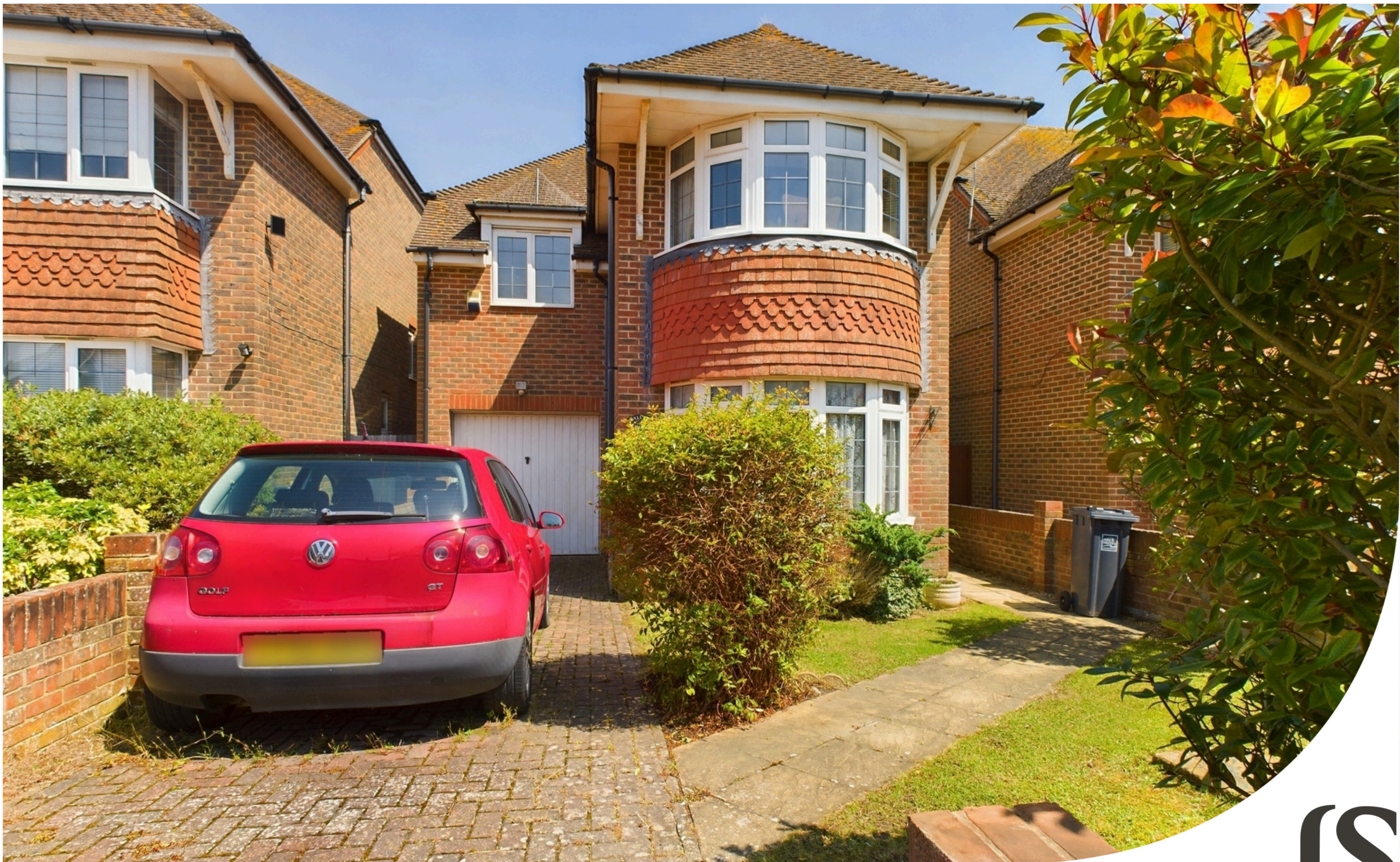
Wallace Mews Wallace Avenue, Worthing, BN11 5SS Offers Over £600,000