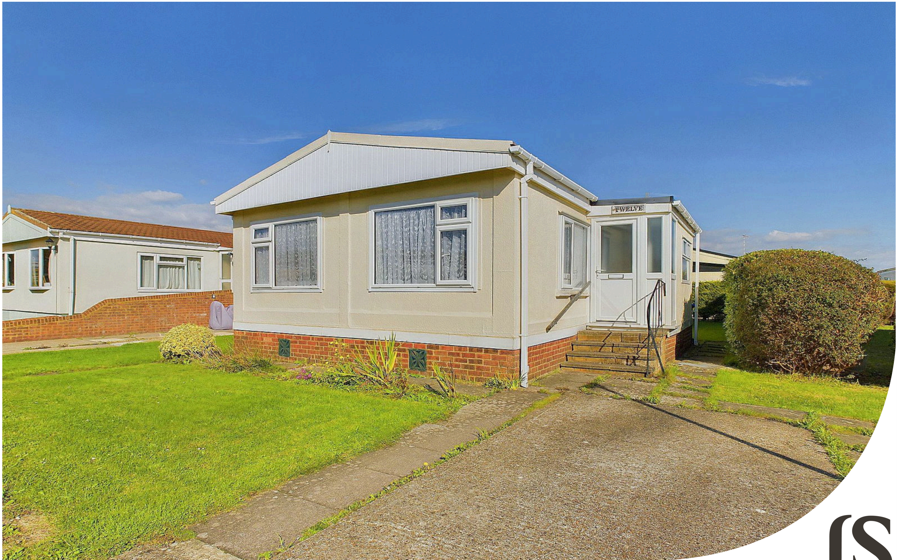
Windsor Way, The Broadway, Lancing, BN15 8NW Offers in the Region of £180,000