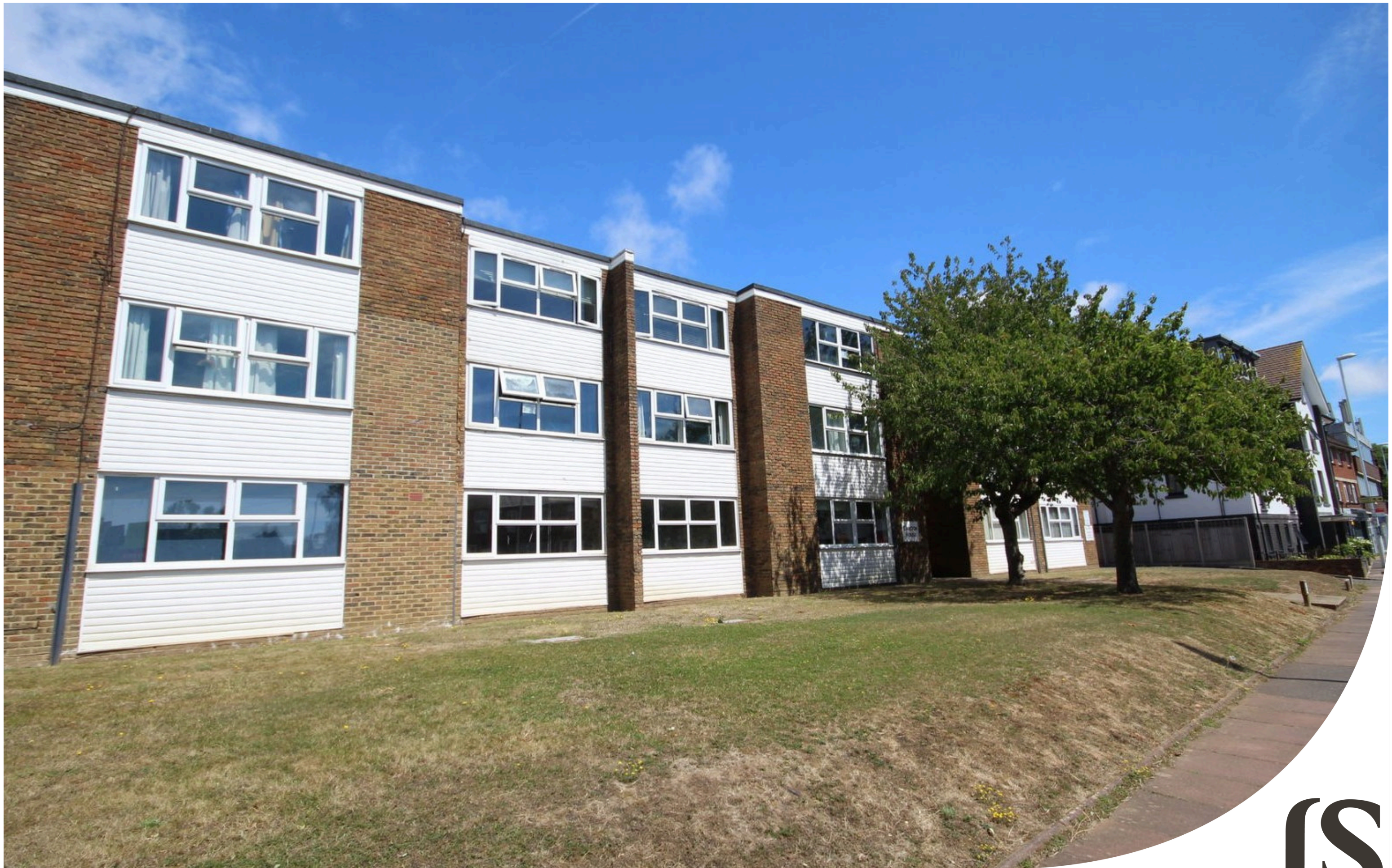
Carlton House | Worthing | BN13 1RD Guide Price £160,000