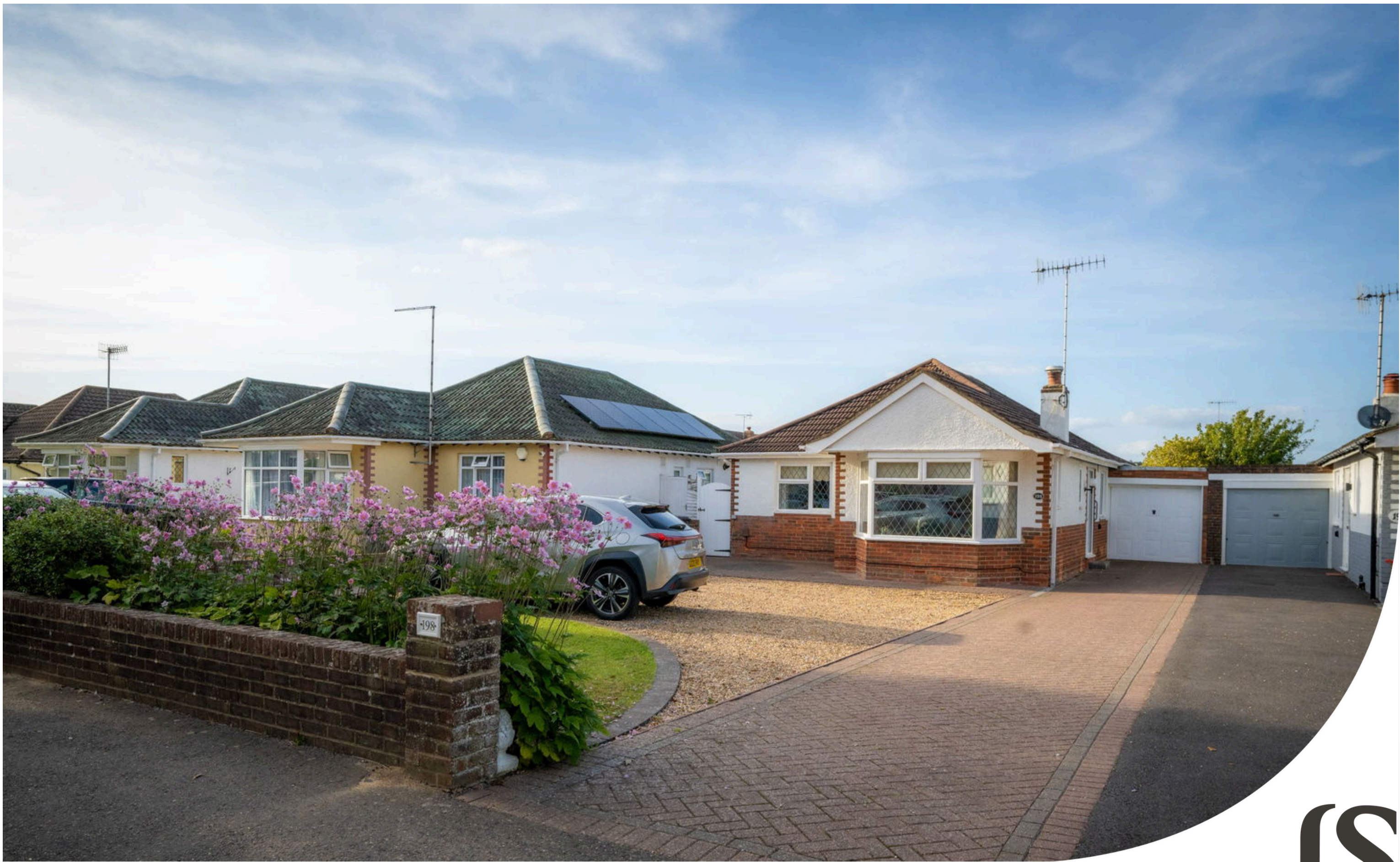
Goring Way, Goring-by-Sea, Worthing, BN12 5BS Asking Price of £500,000